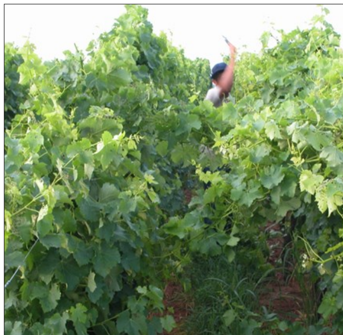
Fig. 2. Excessive grapevine growth is associated with increased fungal disease and may require remedial canopy management.

Vineyard cover crops or ‘living mulch’ consists of either sown or native vegetation, grown in vineyard row middles and/or inclusive of the area under the vine trellis (Fig. 1). Although cover crops can increase pest pressure (arthropods and voles) and vineyard management costs (Karl, 2015), benefits of cover crops include: erosion and weed control, reduction of herbicide use and mitigation of excessive vine vigor. Excessive vegetative growth is a common problem in grafted wine grape vineyards in the humid eastern and Midwestern United States. Such vines are described as being “out of balance” (Fig. 2).