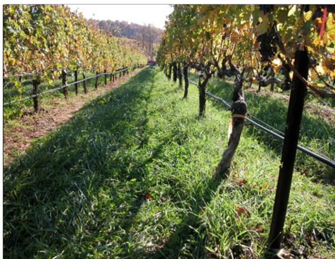
Fig 1. Perennial grass planted under trellis and in the row middles as living mulch with standard herbicide-treated vine rows on the left.

Gill Giese (Shelton Vineyards, Dobson, NC)