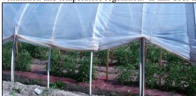
Figure 2. Side ventilation of a tomato high tunnel.

From Knott's Handbook for Vegetable Growers (4 th Edition).