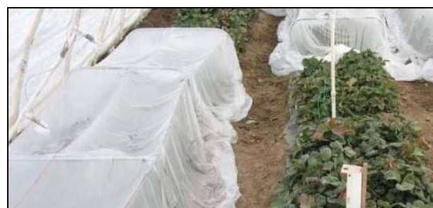
Figure 3. Low tunnels within a high tunnel.

sufficiently reduce the temperature then the side walls can also be opened (Figure 2). Doors should be closed in the late afternoon to retain heat through the night time. Low tunnels placed over individual rows of crops within the high tunnel can add an additional “temperature lift” to prevent cold damage at night (Figure 3). Low tunnels also require careful ventilation to prevent extreme high temperatures. Without proper ventilation of both high and low tunnels, temperatures in a Northern Utah high tunnel have exceeded 120°F on a sunny day in early March.