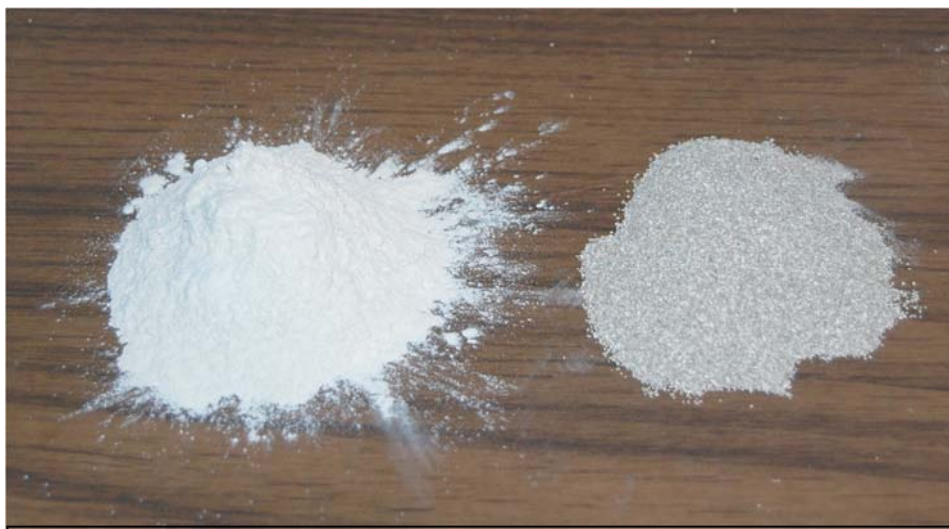
Figure 4: Two different types of bleaching clay. Shown on the left is a sample that is mixed with the oil, heated, and put through a filter press. On the right is a sample that is used as a filter in itself, which the oil is passed through. In both cases, the unwanted components in the oil are bonded with the clay, removing them.

nents that increase the rate of oxidation. When oil is used at high temperatures, for example when pan frying or deep-fat frying, oxidation is accelerated and the oil may develop undesirable characteristics such as off flavor or dark color quickly. Bleaching allows the oil to be used for a longer period of time before these undesirable characteristics occur.