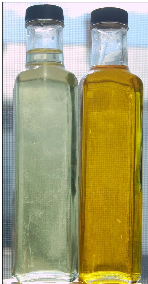
Figure 5: Bleached canola oil (left) and un-bleached canola oil (right) are very different in color due to the natural colorants removed during bleaching.

steaming the oil, which vaporizes the unwanted components and separates them from the desired material. For the small-scale or local producer, this process may not be desired, for several reasons. Deodorizing removes flavor and odors which are often prized in oils, enhancing the flavor of the foods they are used to prepare. Also, this process requires additional equipment which can be costly to purchase and maintain.