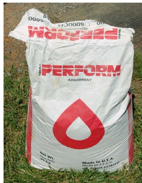
Figure 3: A bag of bleaching clay.

acid, 98% oil. The acid is composed of a solution of 30% acid with 70% water. This total mixture is kept at 80° C for up to 15 minutes, then rapidly cooled, settled, and separated via centrifuge. Commercial operations may include additional processes in the refining stage.