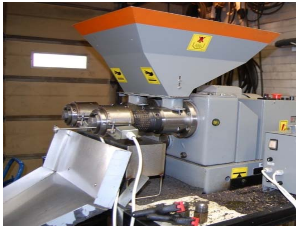
Fig. 1: Oilseed press

Oilseed presses vary in size and the amount of oil expected varies between seed types. As a result, the