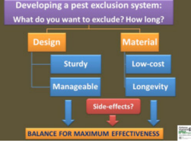
Figure 1: Basic elements of insect pest exclusion system that balances design and material for maximum effectiveness.

The goal of this system is to PREVENT insect pest establishment and reduce the overall pest pressure. The goal is NOT to exclude ALL pests or beneficial insects. In other words, an ideal HTPE system should have a good balance of stopping pest species while allowing beneficial insects to colonize the plants.