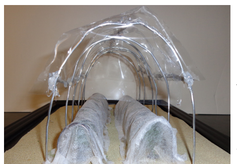
Figure 4. Row covers or fine insect screens crop protection from small insect pests when installed early in the season.

In this way, both producers use multiple IPM strategies for full benefit to their small farms. A third on-farm test site is under construction in Alabama to test 40 percent shade cloth in the open field.