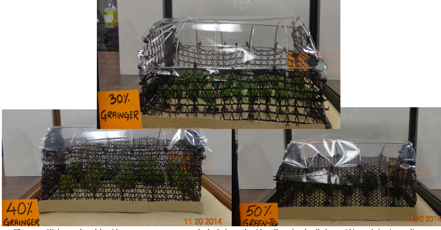
Figure 2: High tunnel models with 30 percent to 50 percent shade cloths on the sidewalls and endwalls for rapid insect behavior studies.

Green lacewings, a popular beneficial insect of choice among organic producers, can be excluded with 40 or 50 percent shade cloth on the side-walls. Adult lacewings, with their large net-like wings, are not able to penetrate those barriers.