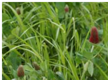
Flowering crimson clover in a diverse cover crop mixture