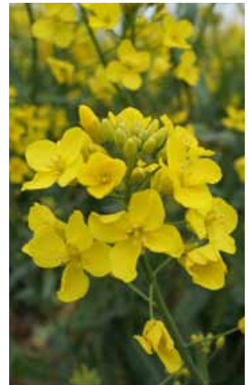
Flowers of Austrian winter pea (Left) and canola (Right) showing diversity in flower shape and pollinator accessibility.

Cover crop mixtures or monocultures? Recent research has shown that flower density has a significant influence on the number of bees that are attracted to a particular patch of cover crop flowers, with greatest bee visitation in those with highest number of open blooms per area. Therefore, a monoculture of canola will be more attractive at peak flowering than a neighboring cover crop mixture that contains a lower total seeding rate of canola plants mixed with non-flowering cover crops (e.g., cereal rye), and thus more widely dispersed flowers. However, if there are goals beyond providing resources for pollinator benefit, planting a diverse cover crop mixture that includes other cover crop species (e.g., legumes or grasses) as well as flowering species can provide maximum potential benefit for soil health, crop productivity and pollinator conservation.