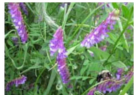
Carpenter bee ( Xylocopa virginica ) on hairy vetch