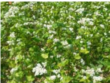
Flowering buckwheat