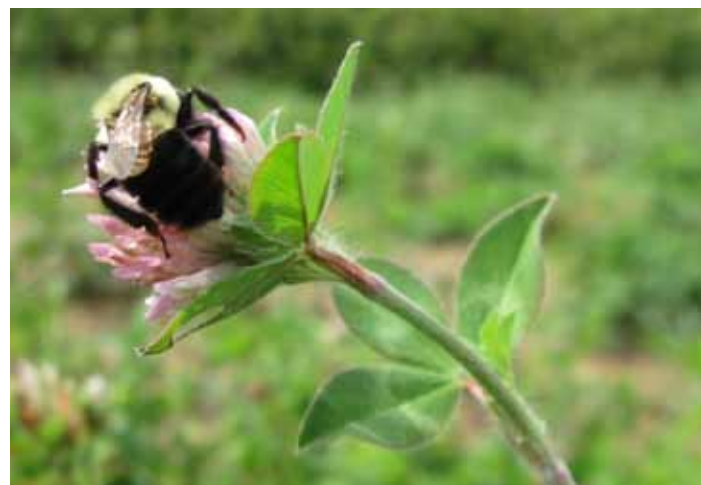
Bumble bee queen ( Bombus sp. ) visiting red clover.

Agricultural landscapes can present many threats to native bee communities. Such threats include destruction or fragmentation of natural habitat and the food and nesting resources it provides for pollinators, as well as exposure to potentially toxic agricultural pesticides. However, there are many conservation strategies that can be employed across your farm or in your garden to help maintain healthy native bee populations.