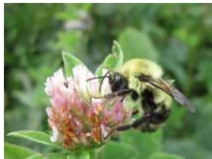
Male bumble bee ( Bombus sp. ) visiting red clover