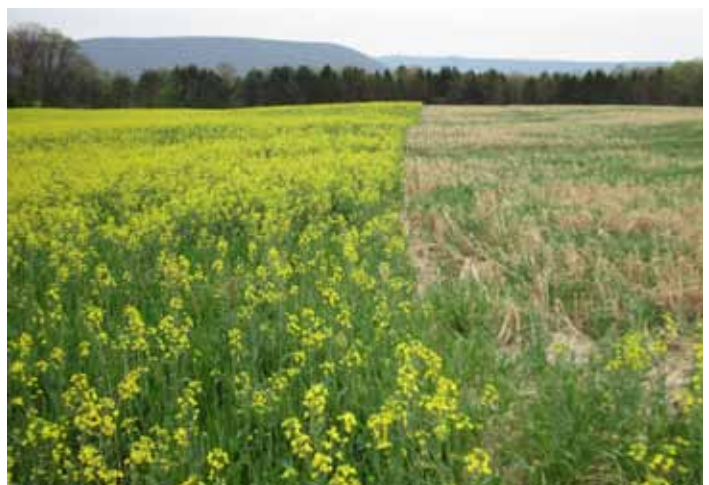
Comparison of two types of cover crops in a field in Centre County, PA; on the right is a monoculture of winter-killed oats and on the left, a diverse cover crop mixture containing spring blooming canola.

While all of these practices can help conserve native bee populations, considering alternative approaches that can be incorporated directly into cultivated fields can potentially benefit crop productivity as well as the local pollinator community. Growing flowering cover crops during fallow periods in your crop rotation is one such multi-purpose strategy.