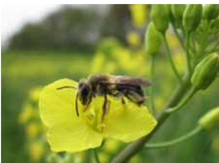
Andrena species on canola flower