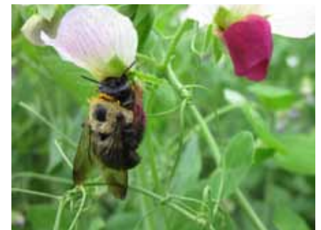
Carpenter bee ( Xylocopa virginica ) on Austrian winter pea flower