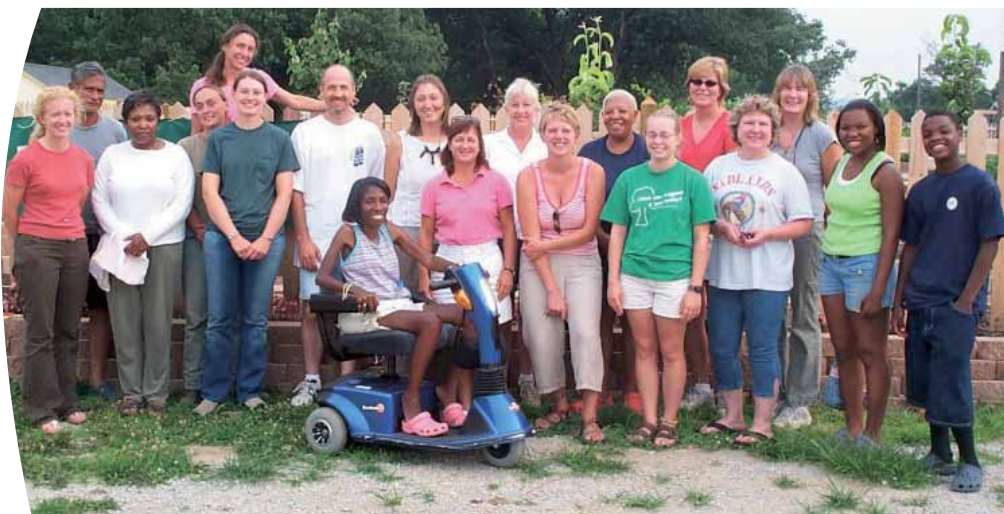
Growing Growers apprentices, host farmers and other participants following a workshop on the taste and nutrition of food held at the Kansas City Community Gardens, Kansas City, MO.