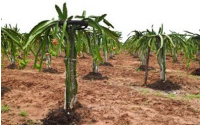
Figure 03. Single post trellis system.