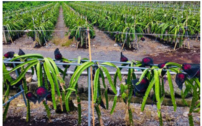
Figure 04. Wire trellis system.