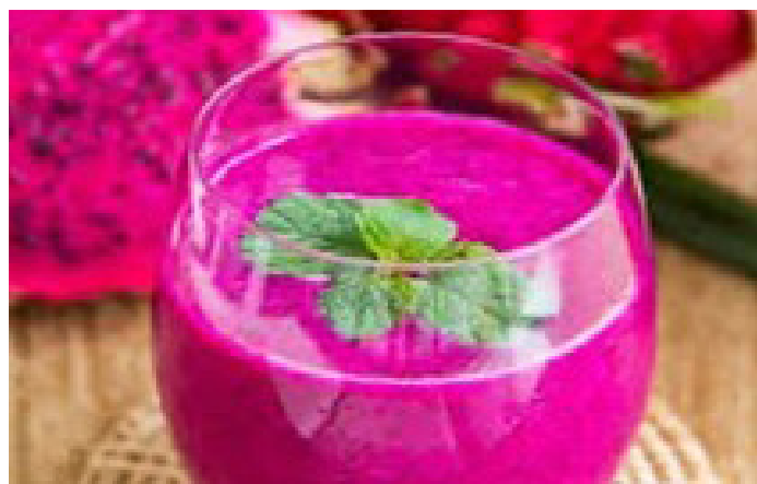
Figure 06. Dragon fruit smoothie beverage.

Dragon fruit is cultivated primarily as a fruit crop. However, with attractive, fragrant night-blooming flowers and bright-colored fruits, dragon fruits plants are also planted as ornamentals. The sweet ( Holycereus spp. ) or sour ( Stenocereus spp. ) flesh of dragon fruit is consumed fresh or dried and can be used in a variety of beverages and dishes including smoothies, desserts, and salads (Figures 6 and 7). The skin of the fruit is edible but can be bitter. Dragon fruit contains beneficial vitamins and minerals that aid in combating health issues. This diverse fruit is known to be high in antioxidants and bio-active free radical scavengers known as polyphenolic compounds. These compounds play a crucial role in protecting the human body and its immunity. Dragon fruit is also enriched with beneficial vitamins and minerals that can help reduce cancer risks and regulate healthy blood and energy (Parmar et al., 2019). It is rich in many nutrients and minerals including vitamin B1, vitamin B2, vitamin B3 and vitamin C, protein, fat, carbohydrate, crude fiber, flavonoid, thiamin, and niacin (Hitendraprasad et al., 2019).