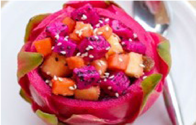
Figure 07. Dragon fruit salad.