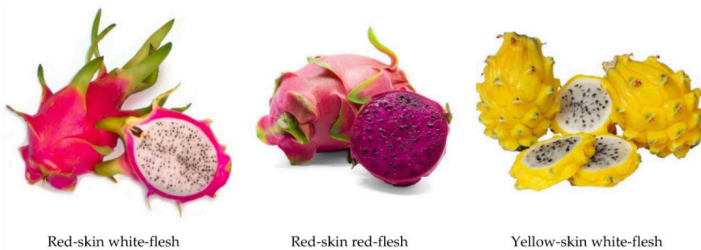
Figure 01. Fruit colors of three species of Dragon Fruit cultivated on Guam.

Dragon fruit, also known as strawberry pear, pitaya, and pitahaya, is a tropical, climbing vine-like cactus native to the Tropical Central Americas (Crane & Balerdi, 2019). There are over 15 species of dragon fruit (USDA, 2019). In Guam, at least three species can be found in cultivation: Hylocereus undatus , Hylocereus megalanthus ( Selenicereus megalanthus ), and Hylocereus spp. (unidentified species) (Bamba, personal communication, February 17, 2017). With many varieties and cultivars, in some cases it is difficult to determine species. Depending on species and varieties, dragon fruit have several combinations of colors of skin and flesh of mature fruits. Common combinations include red or pink skin with white flesh, red skin with pink or red flesh, and yellow skin with white flesh. Figure 1 depicts common colors of fruits of H.undatus , H. megalanthus , and H. polyrhizus . Table 1 lists skin/flesh colors of several species of dragon fruit. Dragon fruit has become a popular fruit in recent years to Guam markets, and has the potential to be a profitable commercial local crop.