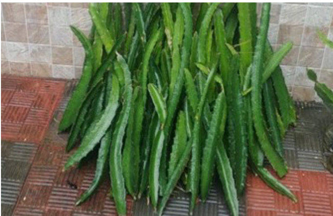
Figure 02. Mature stem cuttings for propagation.

planted directly into designated sites, it is recommended to plant cuttings upright in pots until roots systems are well-developed before planting into designated areas out in the field. Plants from cuttings may produce fruits within 1 year (Crane and Balerdi, 2019). Recommended plant spacing is 9-15 feet between plants and rows (Zee et al., 2004) Dragon fruit plants can also be grown on the ground without any support, but it is highly recommended to be planted with a support system (trellis) for cleaner and easier harvesting and management. Trellis support systems are recommended to be approximately 6-7 feet in height. There are many kinds of trellis systems that are adequate for supporting dragon fruit, from single posts to wires stretched across a row supported by evenly spaced posts. Materials must be strong enough to support the multi-stemmed plant. Stems growing upwards should be secured to trellis systems to prevent plants from falling. Figures 3 and 4 show examples of trellis systems adequate for dragon fruit planting.