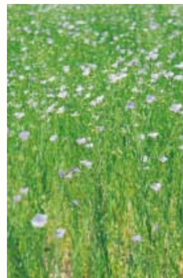
Alternative grains and oilseeds – like, from left, buckwheat, amaranth and flax – add diversity to cropping systems and open profitable niche markets while contributing to environmentally sound operations.

Published by the Sustainable Agriculture Network (SAN), the national outreach arm of the Sustainable Agriculture Research and Education (SARE) program, with funding by USDA's Cooperative State Research, Education and Extension Service.