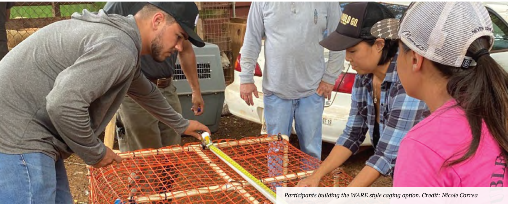
Participants building the WARE style caging option.

Volunteer-engaged, on-farm research builds food system resilience and small farmer’s grant-seeking capacity.