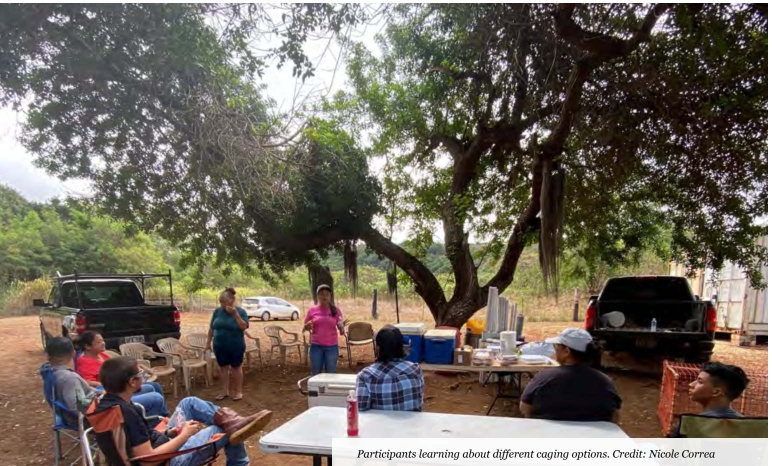
Participants learning about different caging options.