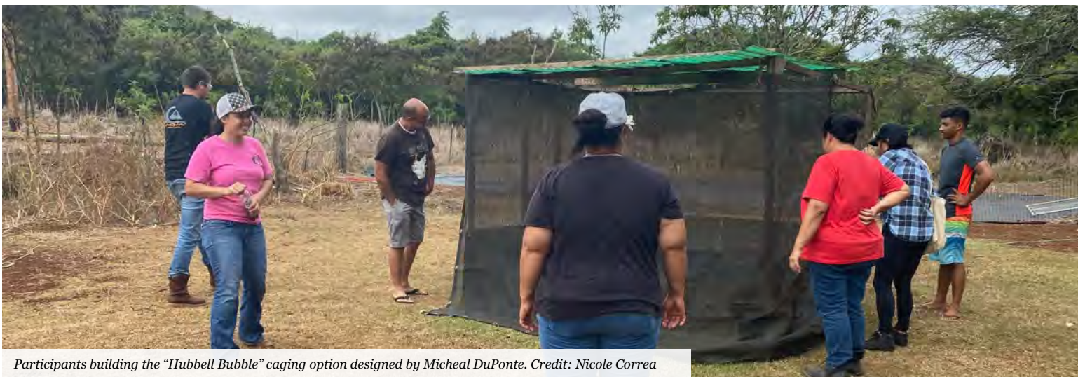
Participants building the “Hubbell Bubble” caging option designed by Micheal DuPonte.