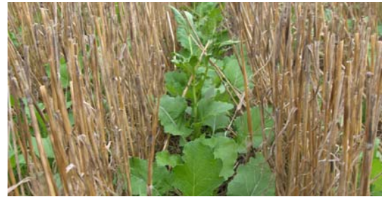
This cover crop mix of turnips, cowpeas and lentils increased corn yields by 18-20 bushels per acre in SARE-funded trials.

Cronin Farms Gettysburg, South Dakota Farm Manager: Dan Forgey