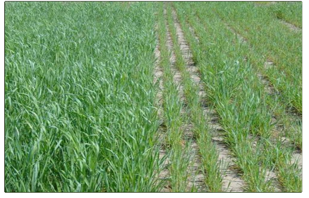
Fig. 3. Fertilized (left) and non-fertilized (right) rye in early spring.