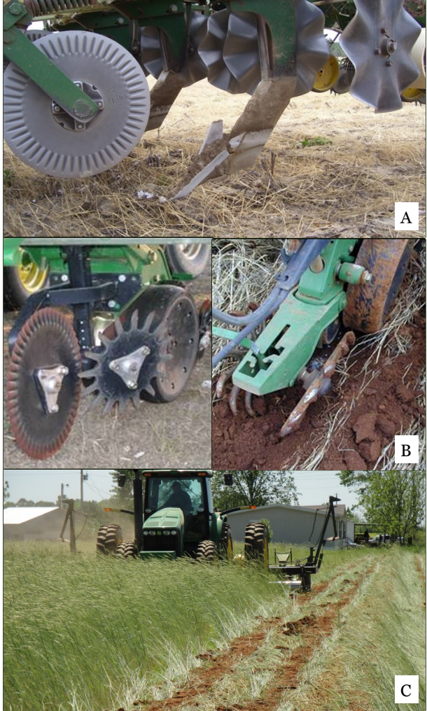
Fig. 4. Example of tillage shank with coulter (A), row cleaners and closing wheels (B), and a combined operation (C) for residue management. Photo courtesy of USDA-ARS, NSDL

Fig. 3. Fertilized (left) and non-fertilized (right) rye in early spring. Photo courtesy of USDA-ARS, NSDL