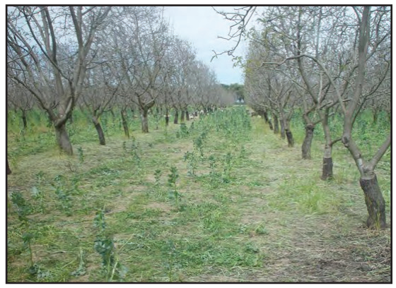
Figure 20: This organic walnut orchard has been grazed by sheep which left the bell beans standing, but devoured the Austrian peas, vetch, and in-row grasses.