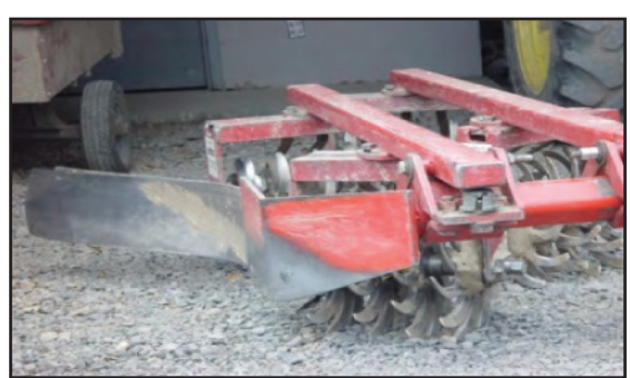
Figure 7: This Lilliston cultivator can be used for light tillage for weed control in the top few inches of soil as well as for incorporation of cover crop residues.

broadcasted over a drilled grass seed. In warm, dry conditions, plant a little deeper (up to 50% deeper); in cool wet conditions plant a little shallower (Schonbeck, 2011).