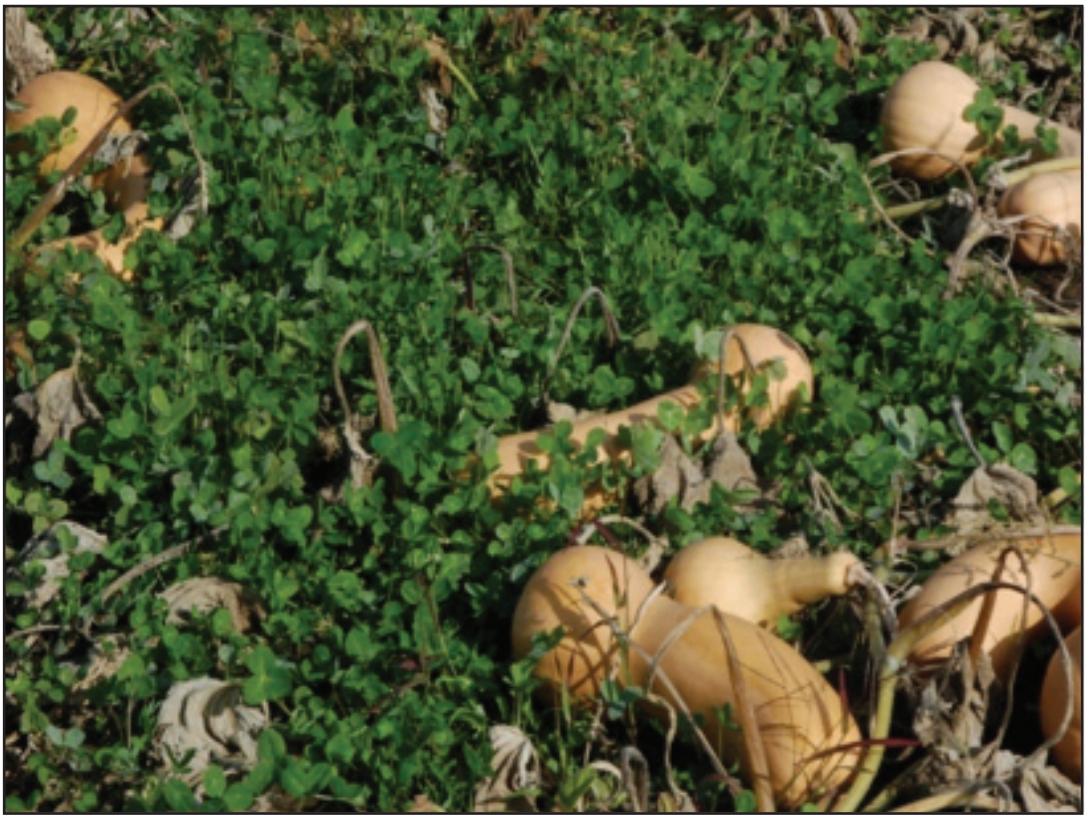
Figure 11. Butternut squash oversewn with red clover in late June/early July just before last cultivation and canopy closure. (Nick Andrews)

nutrient competition. Producers may consider using a more shade tolerant variety based upon the crop they are seeding. White clover, annual ryegrass, rye, hairy vetch, crimson clover, red clover and sweet clover tolerate some shading (Clark, 2007). Broadcasted seed should be heavy enough to fall through the crop canopy. More information about relay-seeded cover crop opportunities and rotations can be found in Table 4, Appendix A.