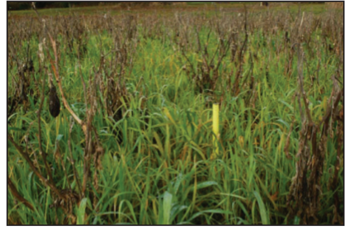
Figure 10. Eggplant oversewn with oats in Western Oregon. (Nick Andrews)

In a western context, establishment of a relay-seeded cover crop will depend on the type of irrigation used. Sprinkler or furrow irrigation will support this approach, but over-seeding into a field using buried drip will likely not be successful. Ideally, overseeding should occur just prior to a rain event or scheduled irrigation. Over-seeding will likely require higher seeding rates to overcome light, moisture, and