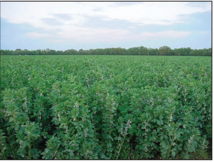
Figure 2. Six-foot-tall fava bean cover crop, Fong Farms, Woodland, California 2006.

Funded by a grant from Western Sustainable Agriculture Research and Education (WSARE).