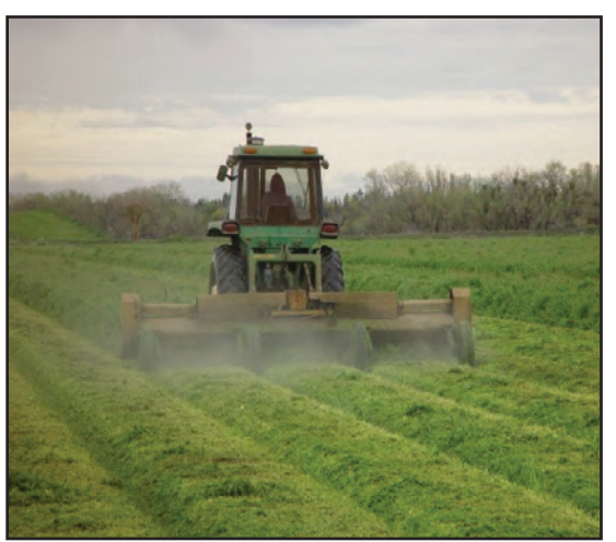
Figure 12: Vetch cover crop being flail mowed close to the bed surface.

Mowing: Mowing is often used to terminate a flowering cover crop before incorporation with a disc. It is a quick method to ensure that cover crops do not go to seed. There are three basic types of mowing machines: sickle bar, rotary and flail. Sickle bars are fast and leave large pieces of stalks on the surface of the ground. They are optimal for a slow decomposing mulch to cover the soil. Rotary mowers (like those commonly used for lawns) are useful in orchard settings to cut groundcover close to trees, but they do not chop residue, leaf litter and prunings as finely as flail mowers. Flail mowers generally require more horsepower than rotary mowers and provide a finer chop may allow for slightly quicker decomposition of the residue. Some producers might opt to transplant directly into a mowed cover crop, a minimum-till option that is usually easier to adopt than roller crimpers. Be aware of challenges inherent with this approach such as cooler, wetter soils and potential pest problems (i.e rodents or slugs).