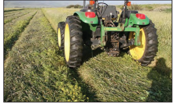
Figure 18: Terminating cover crops on beds using a roller crimper. (Eric Brennan)

Grazing: Depending on the cover crop's purpose, grazing can be an effective method for cover crop management. Grazing removes a substantial portion of the vegetation and may interfere with the goal of enhancing soil organic matter. Grazing animals deposit manure and urine on the soil which has nutrient management as well as potential food safety implications. Producers should consult with their organic certifier as well as NRCS prior to grazing any cover crops.