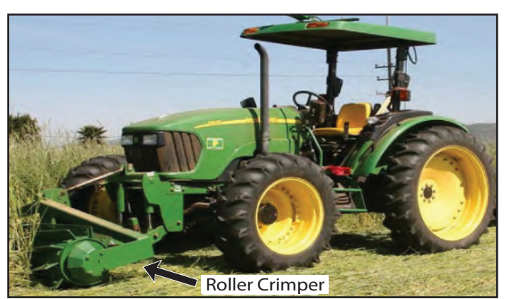
Figure 17: This rye cover crop was terminated using a roller crimper.

Cover crop varieties and timing of termination are crucial components to ensure success in an organic system. Cover crops must reach early flowering to be effectively terminated with roller crimpers. For more information see 'Organic No-Till Farming' listed in resources, Appendix B.