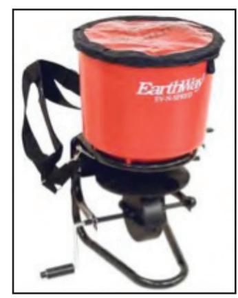
Figure 9: A broadcast seeder, or 'belly grinder', appropriate for small acreage seeding. (Earthway).

One major problem with many methods of incorporating broadcast seed is that often they place the seed too deep, requiring seeding rates 1.5 to 2 times higher than drilling. However, if not set properly, seed drills can easily place seeds too deep as well. Conversely, it is equally important not to place seeds too shallow and avoid them being eaten by birds or drying out after germination and before establishment. Use the recommended seed depth for each cover crop species and be especially careful when seeding mixes. Some drills have an additional hopper where smaller seeds like clover can be placed so that they are