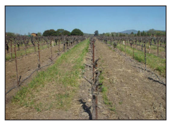
Figure 21. Disking cover crops in every other alley in a vineyard allows the grower access to all vines when the rainy season arrives and keeps down dust.

Cover crops are an important component of organic orchard floor management. They may be planted in the grass alley, legumes planted for nitrogen, or flowering species planted for beneficial insects. While living mulches in the tree row are often used, cover crops can also be grown in the alley and used on the tree row. Often called "mow and blow," this system blows clippings from mowing the alley on to the tree row with side discharge mowers. The alley planting can be grass that produces biomass for mulch,