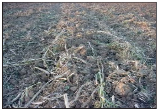
Figure 15. A field one week after disking down a robust legume cover crop and vetch. After the residue decomposes further, the producer will disk one more time prior to forming the planting beds.

Tillage or Disking: Tillage or disking is generally used to incorporate crop residue into the soil. If the amount of residue is small, it might be left on the surface. Lilliston cultivators can be used for light amounts of residue, but for higher biomass covers, or for crops with dense root masses, such as sorghum-sudan, disking or spading the residue into the soil is needed before the next crop is planted. If cover crop residues can be left on the surface, the risk of erosion can be reduced.