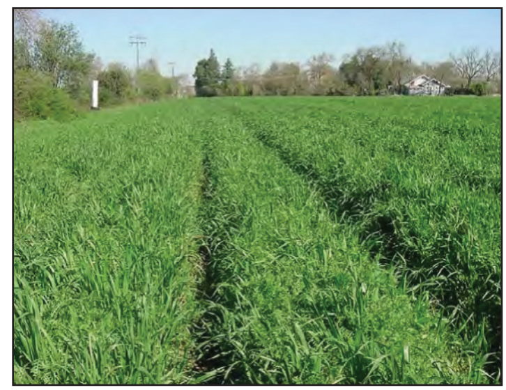
Figure 6. Vetch and rye cover crop on beds.

Annual vegetable operations may have fields with compaction or a plowpan layer where heavy equipment has been run frequently. Clay soils with low organic matter, or those with heavy traffic and grazing, are especially vulnerable to compaction. Compacted soils may not allow rainfall or irrigation water to infiltrate the lower soil horizons, so some deep ripping may be required. While this is more of an issue for cash crops, it could impact the establishment of a non-irrigated cover crop. Subsoiling should be done when soil is dry, often before seeding a fall cover crop. Cover crops such as tillage radish can also be used specifically for the purpose of breaking up compacted soils.