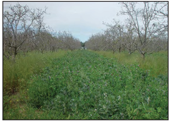
Figure 19: Walnut orchard floor prior to grazing. Note the tall grasses and mix of cover crop species compared to the grazed orchard floor on the right.

Grazing: Depending on the cover crop's purpose, grazing can be an effective method for cover crop management. Grazing removes a substantial portion of the vegetation and may interfere with the goal of enhancing soil organic matter. Grazing animals deposit manure and urine on the soil which has nutrient management as well as potential food safety implications. Producers should consult with their organic certifier as well as NRCS prior to grazing any cover crops.