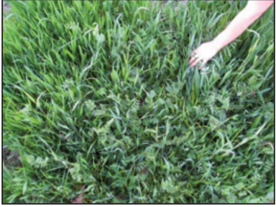
Figure 3. Fall seeded annual rye, vetch, winter peas, favas, and crimson clover serve multiple purposes in Western OR. (Sarah Brown)