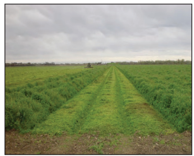
Figure 13: Flail-mowed vetch beds.

Mowing: Mowing is often used to terminate a flowering cover crop before incorporation with a disc. It is a quick method to ensure that cover crops do not go to seed. There are three basic types of mowing machines: sickle bar, rotary and flail. Sickle bars are fast and leave large pieces of stalks on the surface of the ground. They are optimal for a slow decomposing mulch to cover the soil. Rotary mowers (like those commonly used for lawns) are useful in orchard settings to cut groundcover close to trees, but they do not chop residue, leaf litter and prunings as finely as flail mowers. Flail mowers generally require more horsepower than rotary mowers and provide a finer chop may allow for slightly quicker decomposition of the residue. Some producers might opt to transplant directly into a mowed cover crop, a minimum-till option that is usually easier to adopt than roller crimpers. Be aware of challenges inherent with this approach such as cooler, wetter soils and potential pest problems (i.e rodents or slugs).