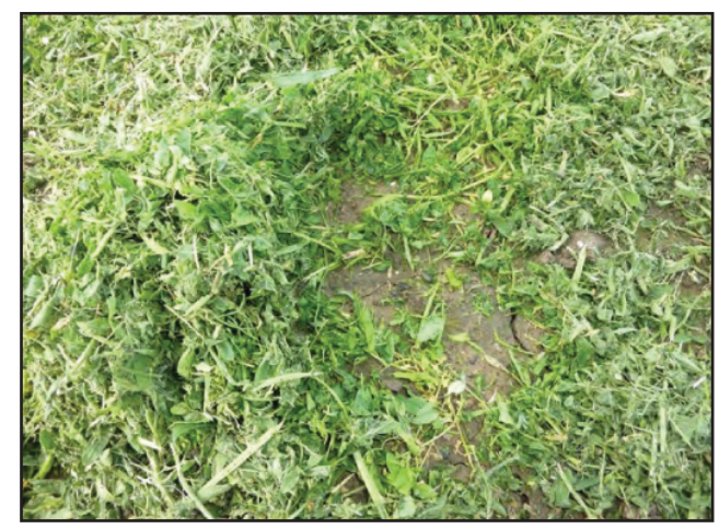
Figure 14: Residue of vetch cover crop is about 3-4" thick. In this situation the residue was be allowed to dry down, and then lightly incorporated with a Lilliston cultivator.

Tillage or Disking: Tillage or disking is generally used to incorporate crop residue into the soil. If the amount of residue is small, it might be left on the surface. Lilliston cultivators can be used for light amounts of residue, but for higher biomass covers, or for crops with dense root masses, such as sorghum-sudan, disking or spading the residue into the soil is needed before the next crop is planted. If cover crop residues can be left on the surface, the risk of erosion can be reduced.