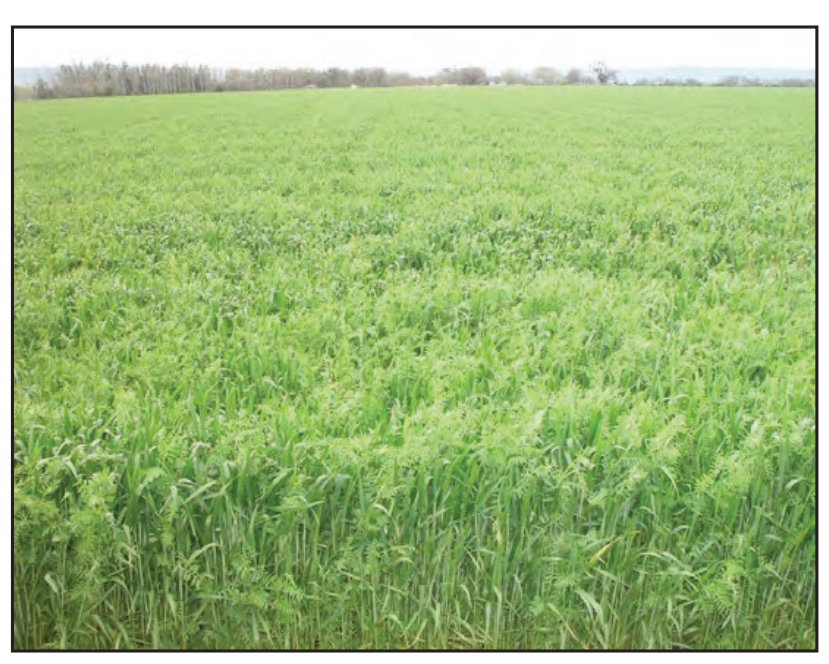
Figure 5. Stand of a vetch and oats, unbedded.

To establish a cover crop successfully, field preparation is the first critical component to address. Two of the primary issues to consider are weed management and the development of a smooth seed bed for good seed-to-soil contact. Ideally field preparation will mirror that for annual cash crops, but can be less intensive. Soil should be worked at an appropriate moisture level to be free of clods and ensure good seed-to-soil contact. In order to gain the maximum benefit from the cover crop, producers should provide appropriate moisture. In some cases producers can relay seed into young vegetable plantings at the end of the weed management period and establish cover crops with no seedbed preparation or seed incorporation. If cash crops are harvested very late, consider relay seeding options, or broadcast annual ryegrass and common vetch after harvest.