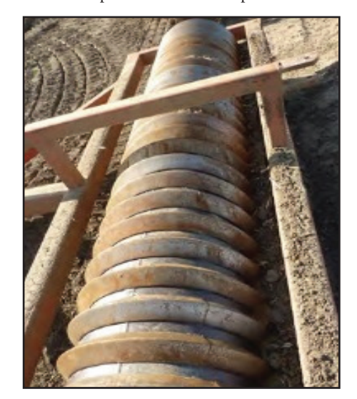
Figure 8: A cultipacker, or ring-roller, is used to firm the soil surface which helps seed-tosoil contact and breaks clods of soil. They can be used successfully to lightly incorporate cover crop seed.

Cover crops can be planted in the fall, spring, or even the summer. The timing depends on the purpose for implementing the practice as well as equipment and the cover crop species chosen. In some areas, during most years a cover crop planted in the fall can germinate and grow simply on rainfall. However, it may require sprinkler irrigation in order to bring up a fall-planted cover crop if the rains are late or it is a dry year. A summer cover crop will be more expensive because in most locations it will require irrigation and involves a higher opportunity cost as a cash crop is foregone during the main growing season. Drought tolerant summer cover crops like Sudan x Sorghum hybrids can grow well with little to no irrigation.