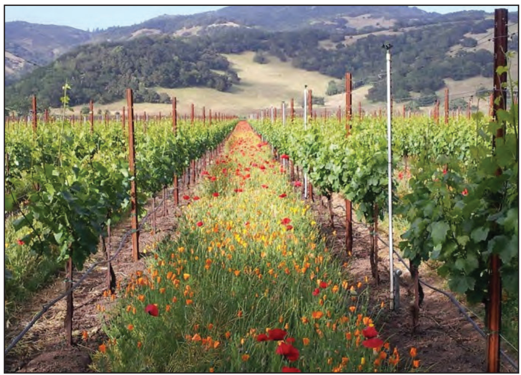
Figure 22. This cover crop in a vineyard provides good habitat for beneficial insects and is aesthetically pleasing.