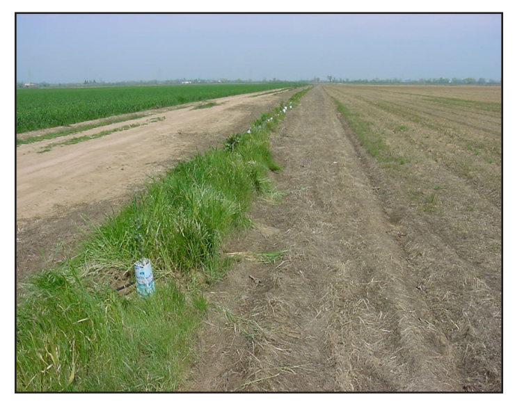
Figure 7. This hedgerow has become overwhelmed with grass weeds. Many of the plants succumbed to the weedy competition, even though they had the carton protection, which helps mark the plants for agricultural workers, and protects the young plants from wind and sun and, to a lesser extent, from weed competition. The grower might have been better off using a plastic weed barrier, more aggressive site preparation, or thick mulch.