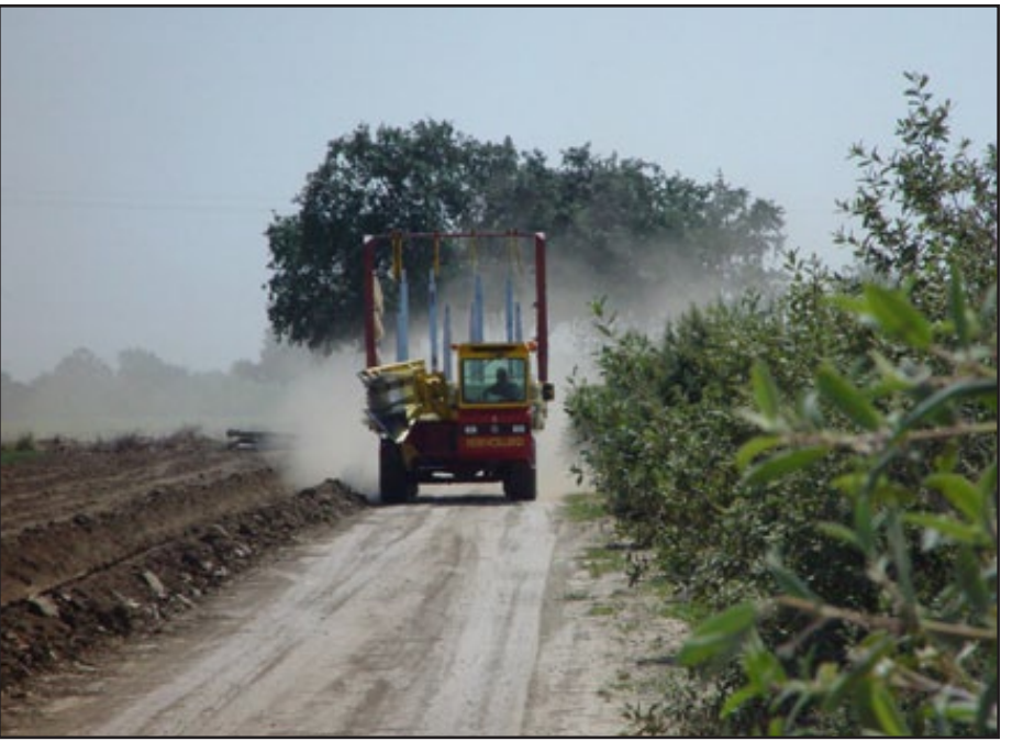
Figure 2. This hedgerow protects the adjacent crop from dust and reduces the risk of dust-induced mite infestations.

Funded by a grant from Western Sustainable Agriculture Research and Education (WSARE).