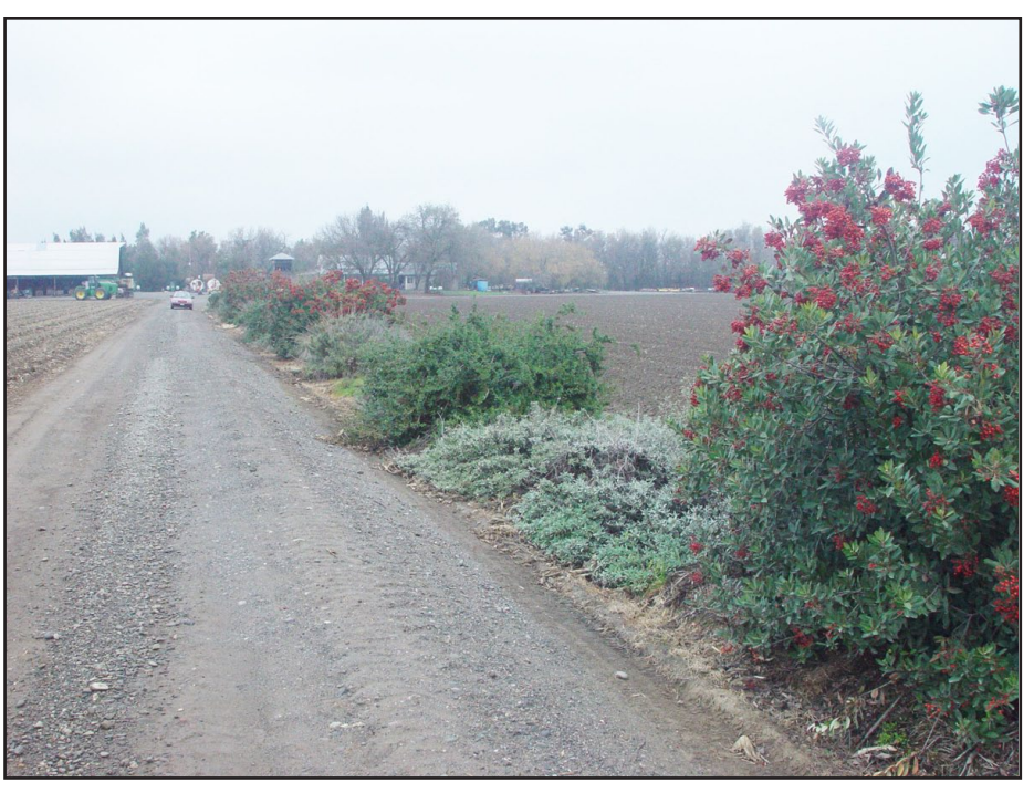
Figure 10. This buffer zone protects the adjacent crop from dust and wind, provides diverse pollen and nectar for beneficials, and offers shelter (including overwintering habitat) for pollinators and natural enemies of crop pests in all seasons. It consists of seven species of native perennials planted in a repeated pattern.

Washington State University Pullman, WA 99164-6211 509-335-6892 Mark.Stannard@wa.usda.gov