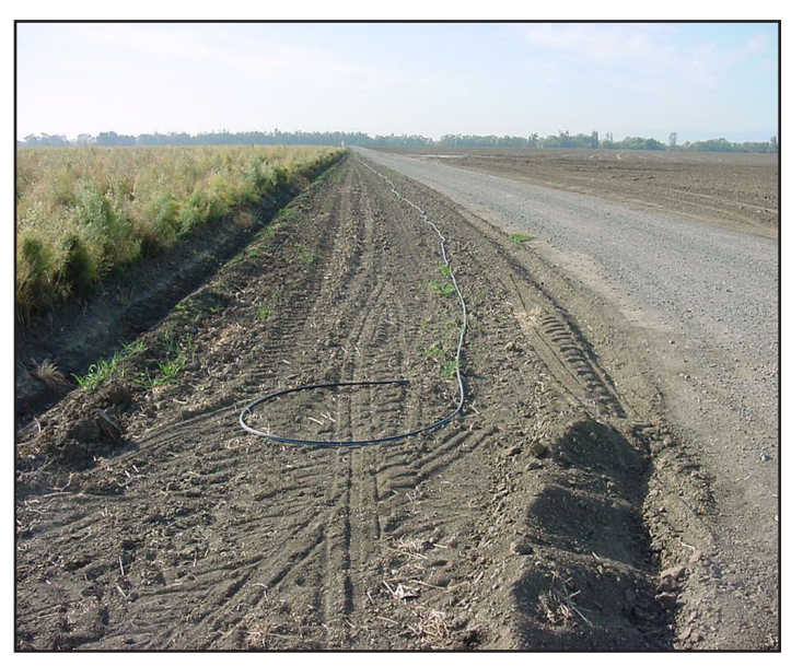
Figure 3. The producer started in October with a weed-free planting bed created by disking the soil to remove weeds.

Figures 3, 4, 5, and 6 show preparation at a single location.