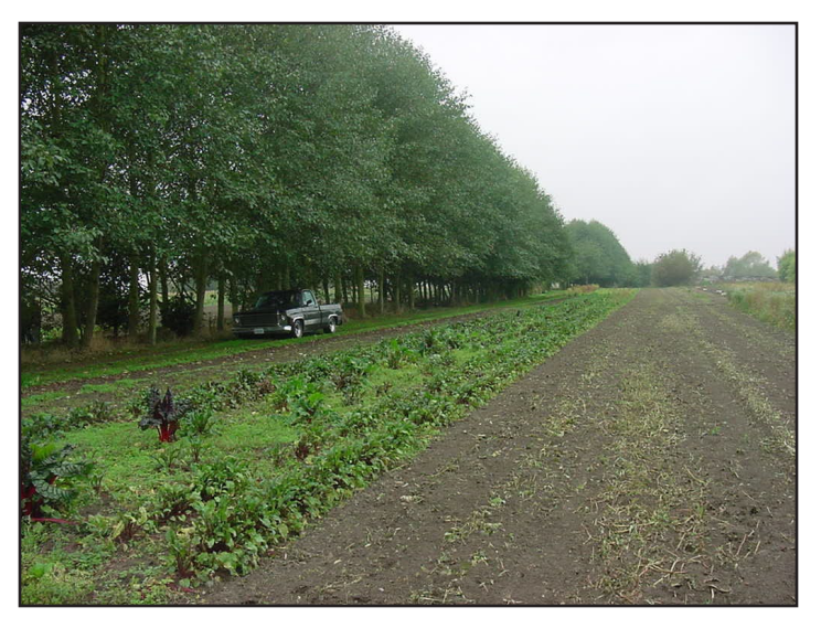
Figure 9. This double row of deciduous trees on a small organic farm in Washington provides a buffer from the neighboring farm, acts as a windbreak, and provides shade for workers and nesting habitat for birds.