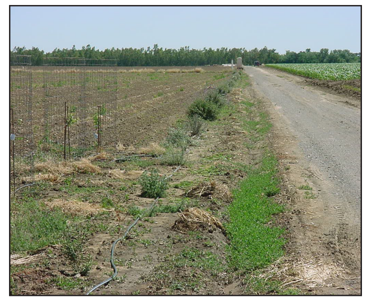
Figure 5. The site in May, six months after planting. Weed management was done with a combination of hand weeding and straw mulch. Note the fruit trees in wire cages for deer protection. This grower includes fruit trees in hedgerows for himself and the workers on the operation.