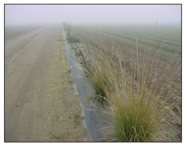
Figure 8. A two-year-old hedgerow with a plastic weed barrier mulch has been very effective in keeping weeds from growing but prevents perennial forbs, such as yarrow, from expanding beyond the holes in which they were planted. The plastic weed barrier also prevents beneficials such as ground-nesting bees, predacious ground beetles, and spiders from accessing the soil.