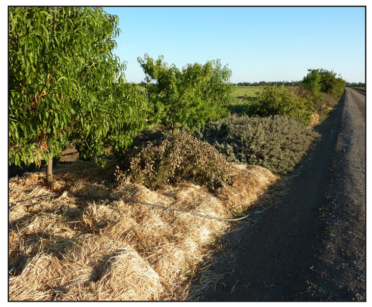
Figure 6. The site in June, three years later. Bare spots in the buffer are still being mulched with straw.