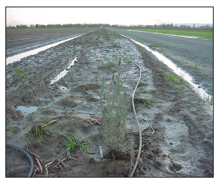
Figure 4. The same site after a January rainstorm, a couple of months post planting.