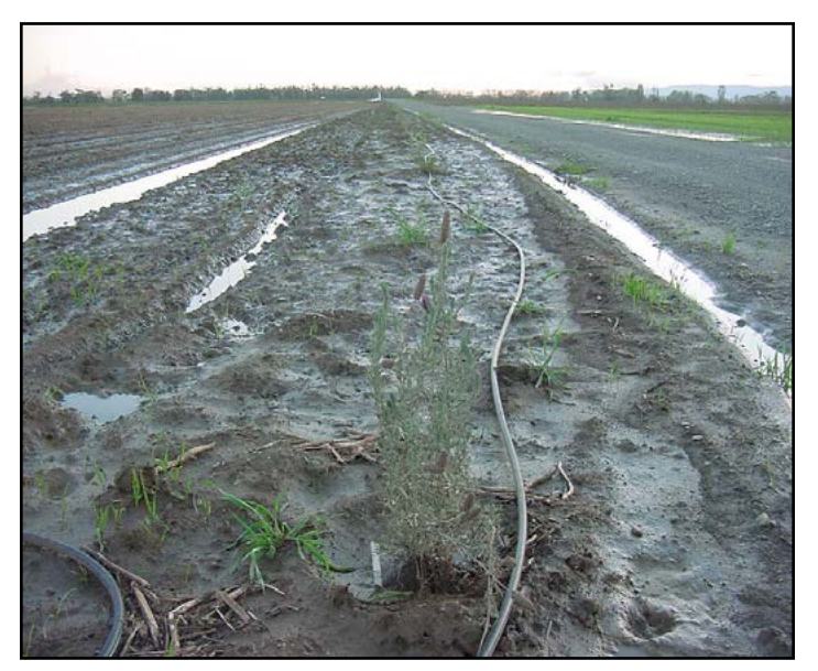
Figure 4. The same site after a January rainstorm, a couple of months post planting.