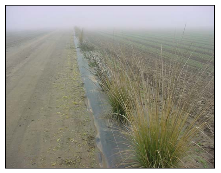
Figure 8. A two-year-old hedgerow with a plastic weed barrier mulch has been very effective in keeping weeds from growing but prevents perennial forbs, such as yarrow, from expanding beyond the holes in which they were planted. The plastic weed barrier also prevents beneficials such as ground-nesting bees, predacious ground beetles, and spiders from accessing the soil.