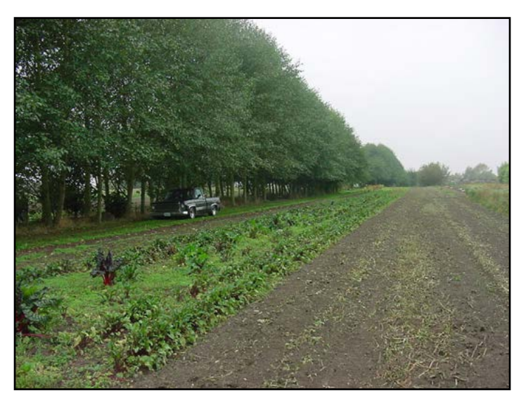
Figure 9. This double row of deciduous trees on a small organic farm in Washington provides a buffer from the neighboring farm, acts as a windbreak, and provides shade for workers and nesting habitat for birds.