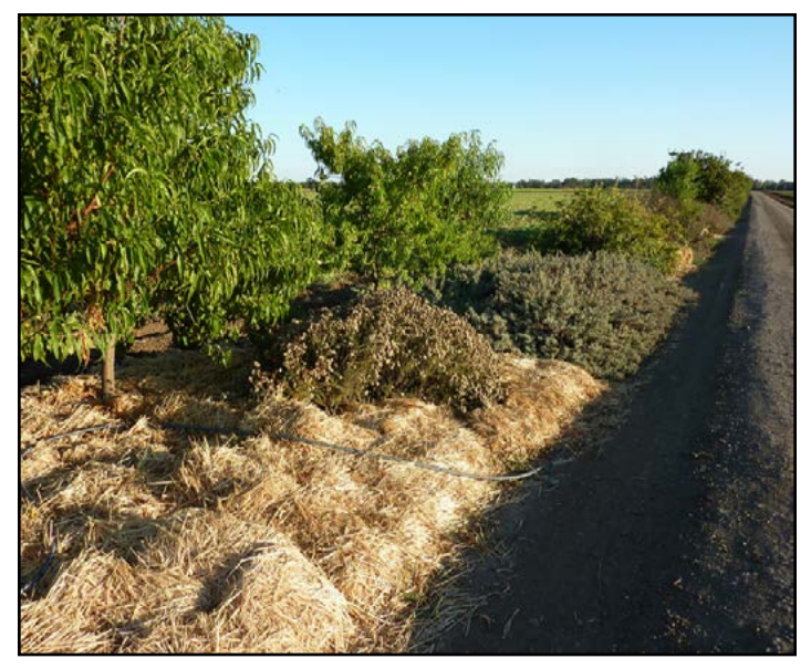
Figure 6. The site in June, three years later. Bare spots in the buffer are still being mulched with straw.