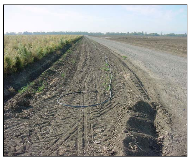
Figure 3. The producer started in October with a weed-free planting bed created by disking the soil to remove weeds.

Figures 3, 4, 5, and 6 show preparation at a single location.