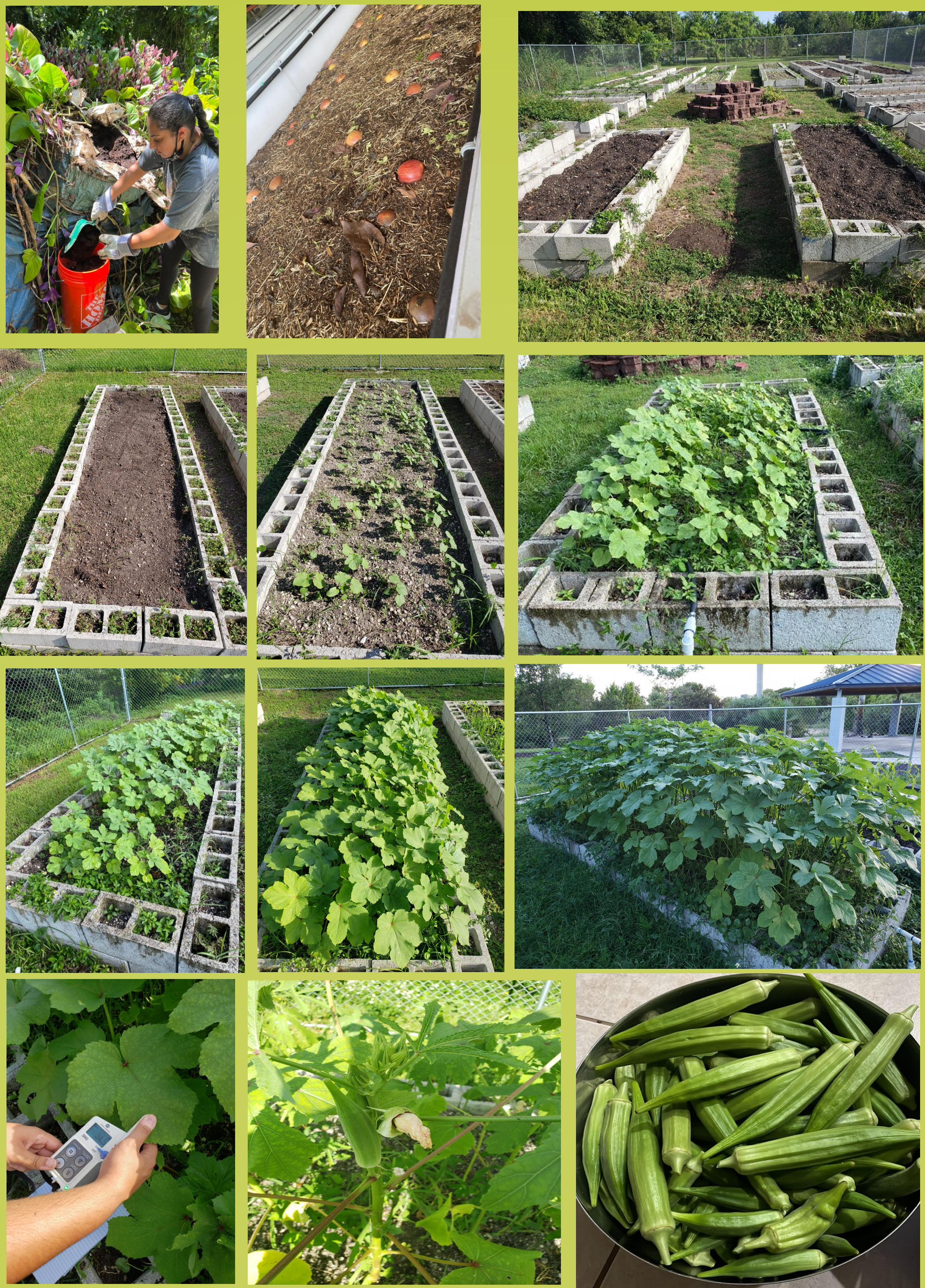
Pictures of poultry manure collection, cyanobacteria biofertilizer application, experimental set up (raised beds), different plant growth stages, data collection and harvested okra