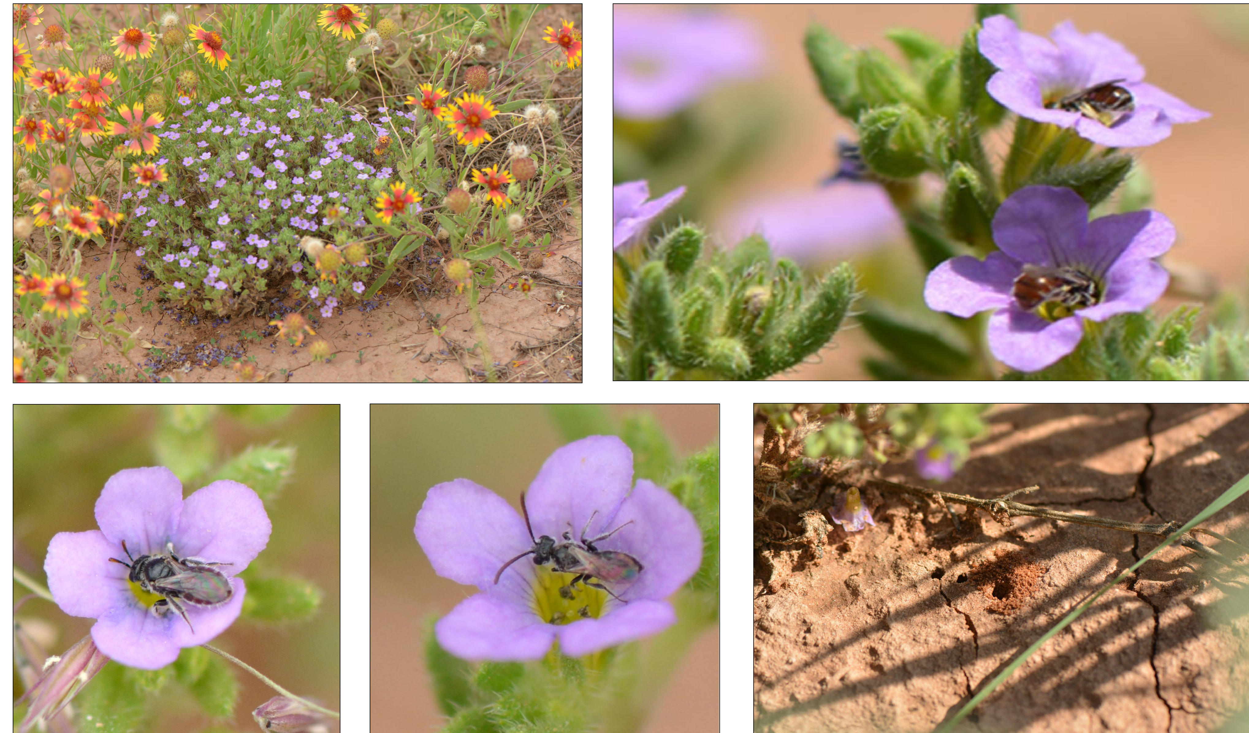
Figure 2. Clockwise from top left: Nama hispidum plant occurring at the Quaker Avenue Research Farm at Texas Tech University in Lubbock, Texas in relation to the more common Gaillardia (i.e. firewheel); two female Sphecodosoma pratti foraging in Nama flowers; soil nest entrance/exit hole of S. pratti below a Nama plant; male S. pratti ; female S. pratti .

Studies are being conducted to understand occurrences of this fauna in relation to climate and ecological factors and farming conservation practices. This specialized bee-plant system could serve as a biological target; our work aims to explore this application through understanding the biology and ecology of specialization among affected landscapes. Findings will provide the background information necessary to determine the efficacy of this native specialized system for biodiversity monitoring in farm conservation programs.