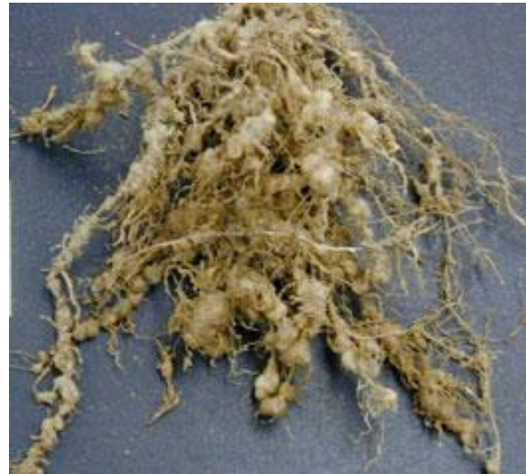
Symptoms of RKN infection on a cucurbit root.

Maryland potato growers met in the fall of 1999 and expressed interest in alternative strategies such as cover crops, non-host rotation crops and poultry manure for managing parasitic nematodes in the potato cropping system. The research and management tactics described in this publication were developed as a result of that meeting.