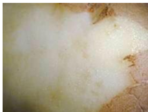
Brown discoloration beneath the potato skin at the site of a RKN infection.

When grown as a double crop option, seed soybean cv. 'Manokin' at 175,000 seeds/acre following harvest of an early season vegetable crop. Maturity of 'Manokin' requires that it be planted no later than late June – early July if it is to be harvested for grain. Soybean may be used as forage, if season length does not allow grain harvest. Following harvest, a non-host (or poor host) crop for parasitic nematodes such as oat or rapeseed can be planted.