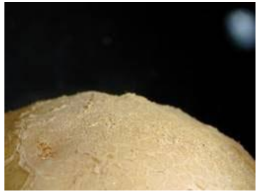
Swelling on the surface of a potato infected with root-knot nematode.

Two non-host cover crops that can be grown in the mid-Atlantic and may provide root-knot nematode population reduction are sorghum sudangrass and castor bean. In cropping system experiments in Maryland, sorghum sudangrass grown annually as a green manure crop following a nematode-susceptible potato or cucumber crop reduced the RKN population as effectively as a nematicide application prior to production of a susceptible soybean cultivar. An annual green manure crop of castor bean also significantly reduced RKN, but annual inclusion of these crops is necessary