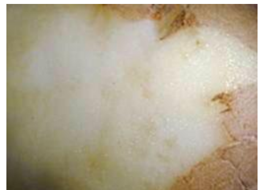
Brown discoloration beneath the potato skin at the site of a RKN infection.

When grown as a double crop option, seed soybean cv. 'Manokin' at 175,000 seeds/acre following harvest of an early season vegetable crop. Maturity of 'Manokin' requires that it be planted no later than late June – early July if it is to be harvested for grain. Soybean may be used as forage, if season length does not allow grain harvest. Following harvest, a non-host (or poor host) crop for parasitic nematodes such as oat or rapeseed can be planted.