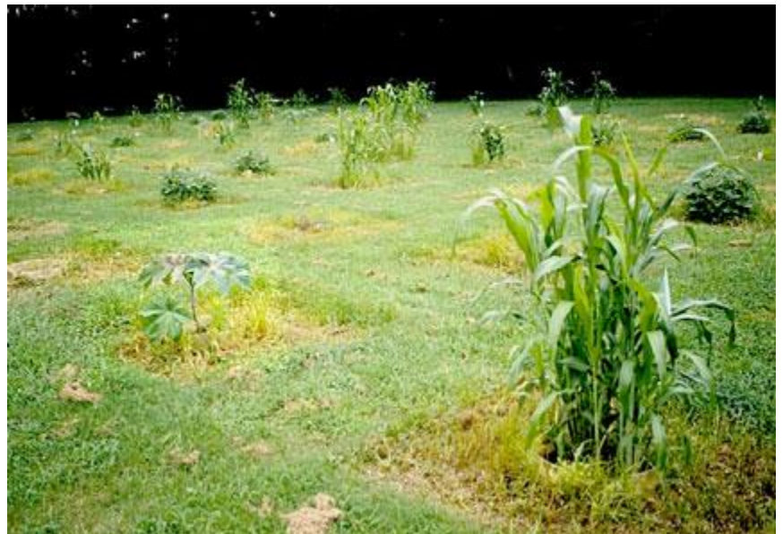
Cover crops grown in micro-plots (note castor bean at left, and sorghum sudangrass at right, in the foreground).

Castor bean cv. 'Mall' grown for green manure is seeded at a relatively low density-11,500 seeds/acre in mid to late July following spring vegetable crop production. Again, approxi-