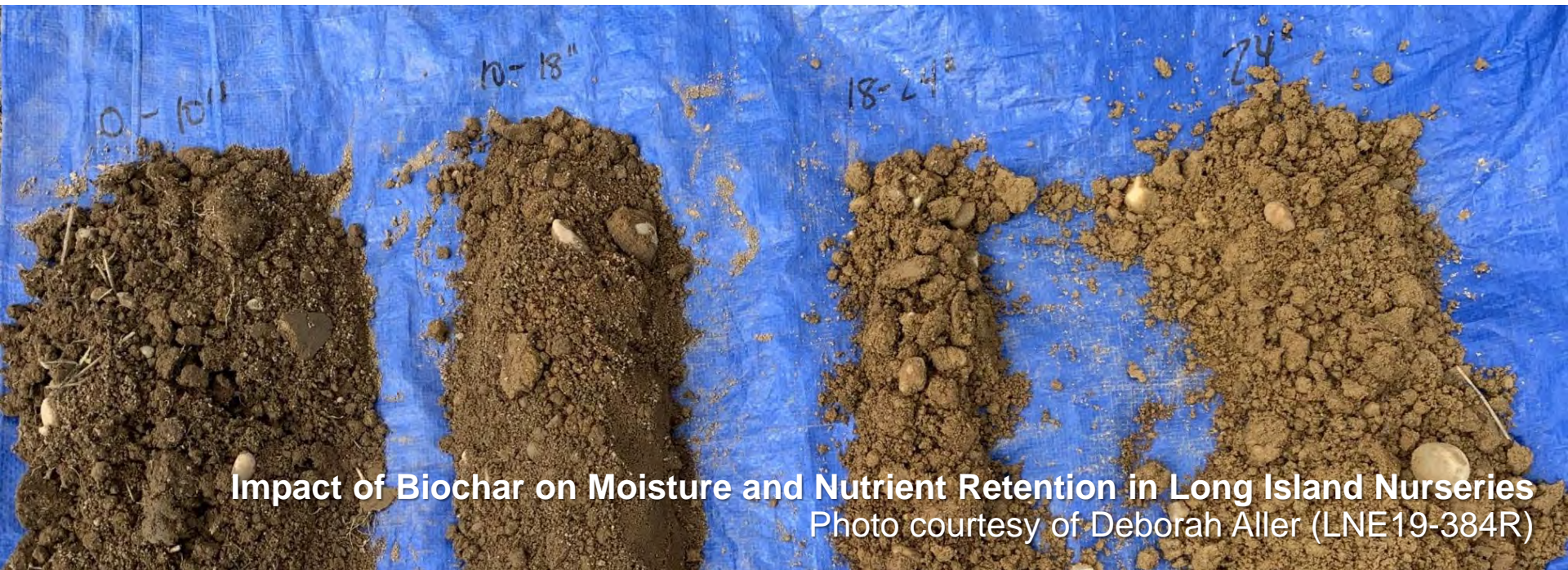
Impact of Biochar on Moisture and Nutrient Retention in Long Island Nurseries (LNE19-384R)