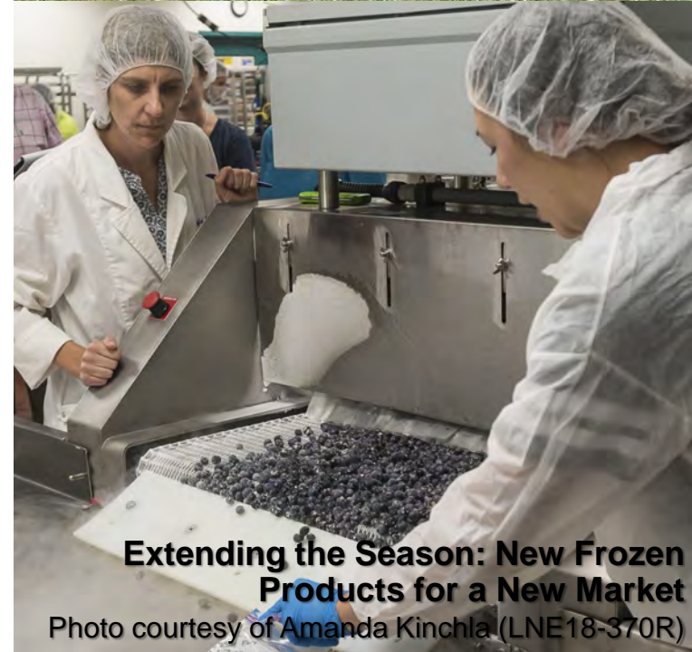
Extending the Season: New Frozen Products for a New Market (LNE18-370R)