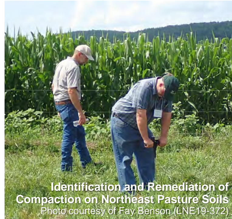
Identification and Remediation of Compaction on Northeast Pasture Soils Photo courtesy of Fay Benson (LNE19-372)

Applicants and host organizations may be located outside of the Northeast region