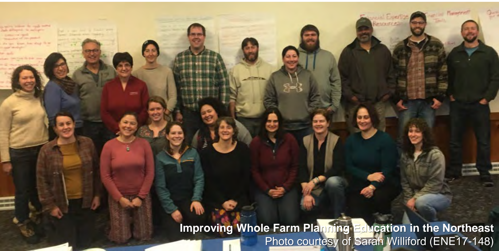
Improving Whole Farm Planning Education in the Northeast Photo courtesy of Sarah Williford (ENE17-148)