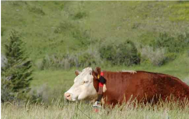
Hereford cow at Ross Ranch resting during midday. Cow activity and position was monitored with GPS collars.