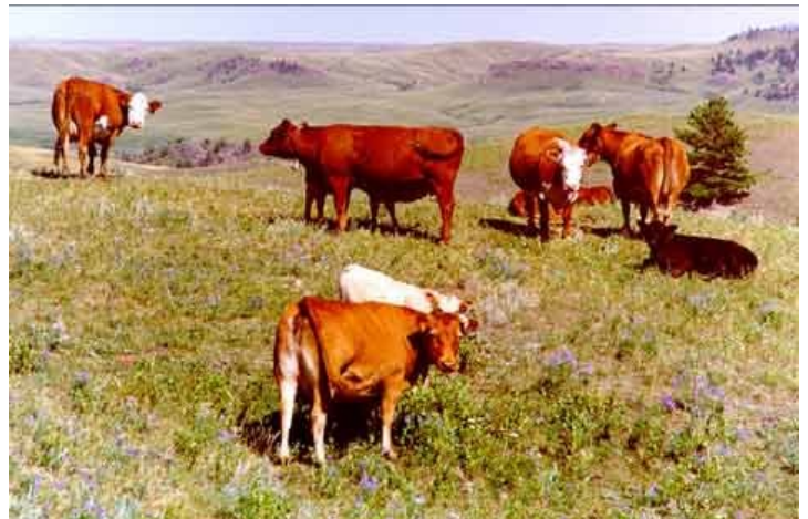
Cows from the hill climber treatment resting on a ridge at the Thackeray Ranch.

cows to cull. It may be difficult to make appreciable difference in grazing distribution, because only a limited number of cattle could be culled for distribution based on normal ranching practices. If grazing distribution is a major issue for a ranch, more emphasis on selection for desirable grazing patterns may be practical. Preliminary analyses have shown that grazing patterns of cows sired by different bulls within the same breed had different grazing patterns. If additional research shows that grazing distribution can be inherited, grazing distribution could be used as a trait for bull selection. Much more rapid progress can be made through bull selection than can be made from culling cows.