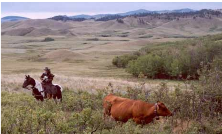
Research technician, Robin Weinmeister, records the position of a Tarentaise cow during an early morning scan sample. This cow was also tracked with a GPS collar, which recorded her position at 10-minute intervals.

Daughters of the Hereford, Tarentaise and Hereford x Tarentaise cows were evaluated in a later part this study. Sires of these daughters were Angus, Charolais, Piedmontese and Salers bulls. Cows sired by Piedmontese and Charolais bulls were observed farther horizontally from water in foothill pastures than cows sired by Angus bulls [8, 9]. Using an index of terrain use, Piedmontese-sired cows tended to use more rugged terrain than Angus-sired cows. Piedmontese cattle were developed in the foothills of the Italian Alps, while Angus cattle were developed in eastern Scotland. These differences in sire breeds are especially surprising considering that only half of the cow's genotype was contributed by the bull.