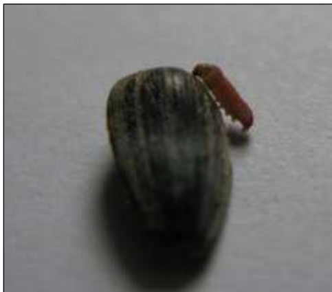
Figure 2. Banded sunflower moth larvae.

Prior to oil extraction, seed samples were dried and moisture levels quantified. Oil was extruded from a subsample of each harvested plot using a Kern Kraft Oil Press KK40. After pressing, oil content and yields were determined. All data was analyzed using a mixed model analysis where replicates were considered random effects. The LSD procedure was used to separate cultivar means when the F-test was significant ( P < 0.10 ).