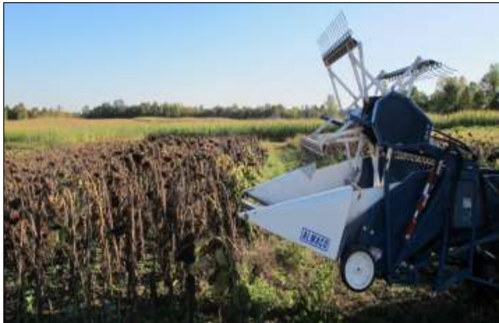
Figure 1. Almaco SP50 plot combine at Borderview Farm on harvest day.

In late July and early August, sunflowers began to flower, and when at least 75% of a given plot was in bloom, the date was noted. During the season, bird netting was used to discourage birds from damaging the developed sunflower seed heads. With this method, bird damage was kept to a minimum. Prior to harvest, sunflower population, height and head width, as well as the incidence of lodging and bird damage, was recorded. Bird damage was estimated using percent evaluations provided by North Dakota State University Extension. Incidence of white mold ( Sclerotinia sclerotiorum ) was noted at three locations on the plant: on the sunflower head, along the stalk, and at the base.