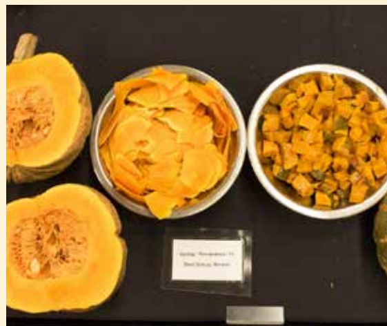
In Oregon, farmers and Extension specialists worked together to expand the local market for winter squash. They identified varieties that would produce well using integrated disease management strategies, would keep in storage, and were marketable to chefs and consumers.

Seeking new ways to help farmers manage soil-borne diseases and increase their winter sales, Oregon State University researchers used two SARE grants to explore the potential of different winter squash varieties (SW15-021 and OW16-008). They looked at everything from disease management to storage and marketability. In one project, the team shared integrated disease management strategies with Willamette Valley farmers, including fungal disease symptoms and scouting, crop rotation, fungicide treatments and the use of disease-resistant varieties. In the other project, they used on-farm trials to assess the profitability of different squash