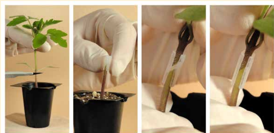
Details of the process for grafting tomatoes.

Wildflower habitat on a Georgia apple farm designed to attract beneficials and native pollinators.