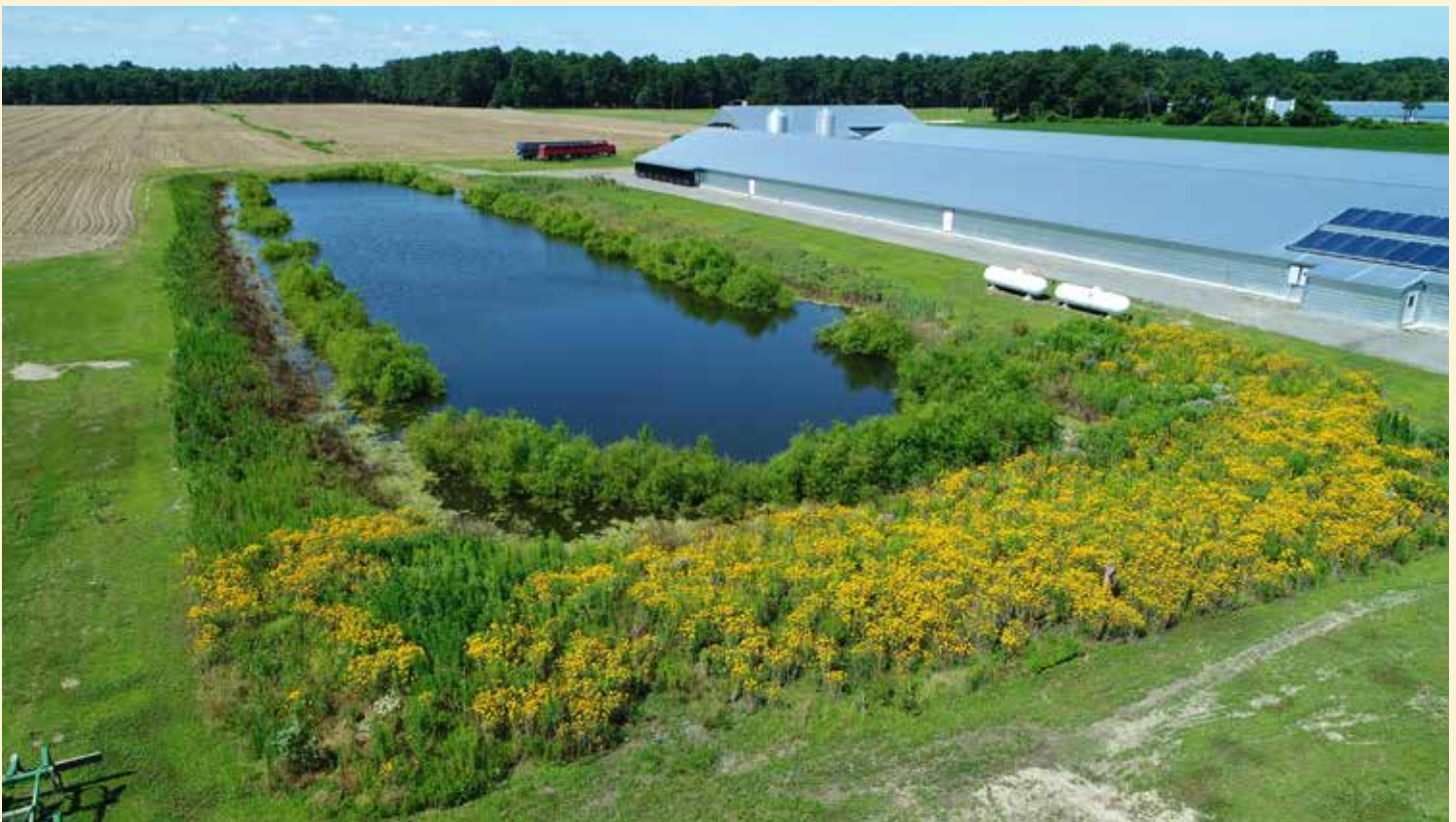
A mixed vegetation buffer near a poultry house at Hill Farms in Houston, Del., offers habitat for pollinators and natural enemies, and reduces dust coming off of the poultry house.

Visit www.sare.org/pests for more information on ecological pest management.