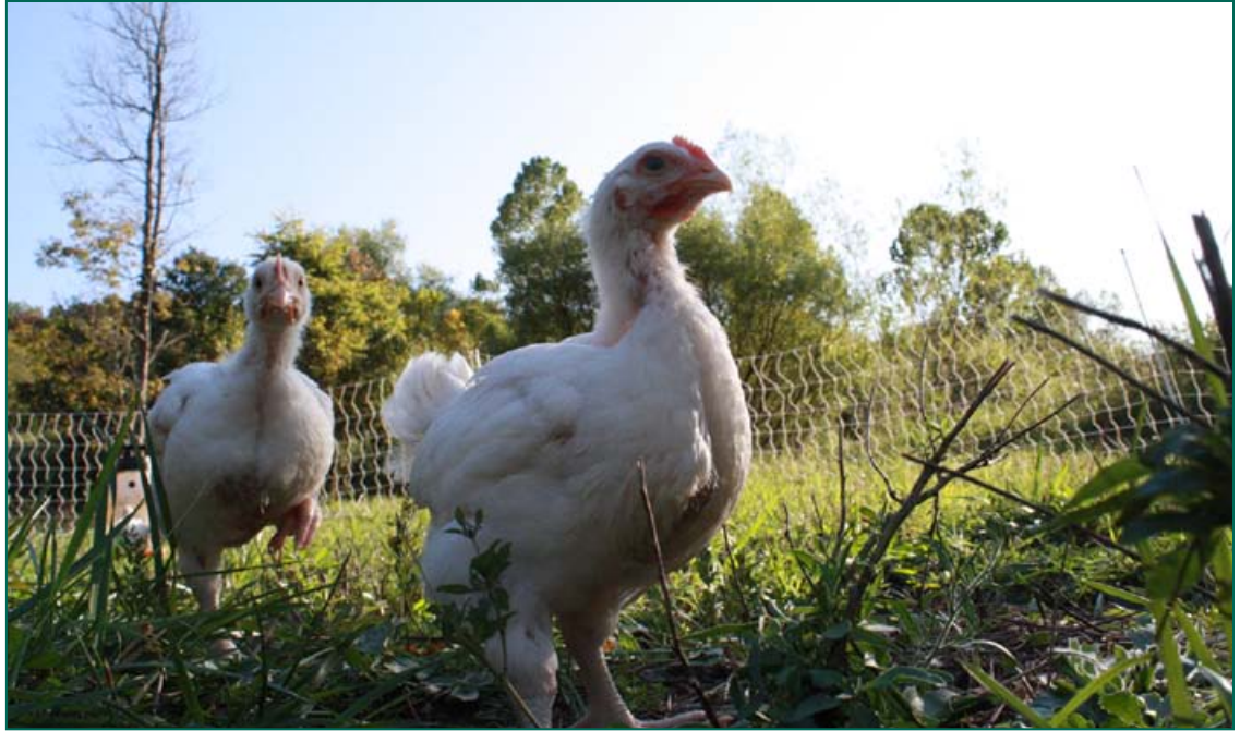
Appropriate grass height encourages foraging and vegetation consumption by the flock.

what can be digested by the animal; the remainder is indigestible.