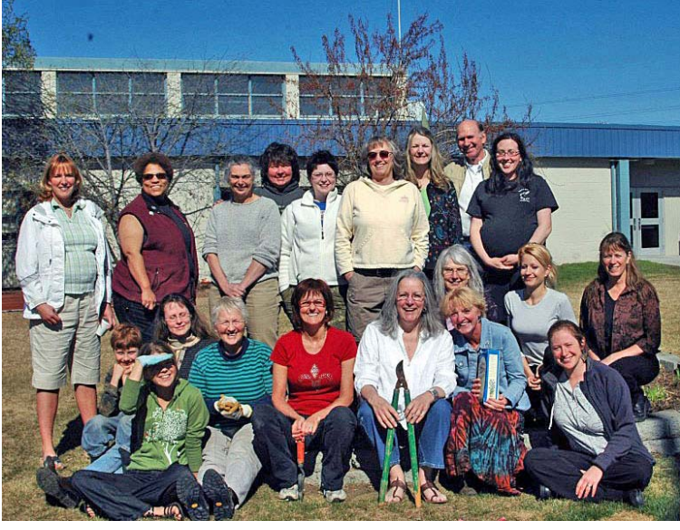
A Master Gardener class.

Hebért excels in the use of media to reach clientele.