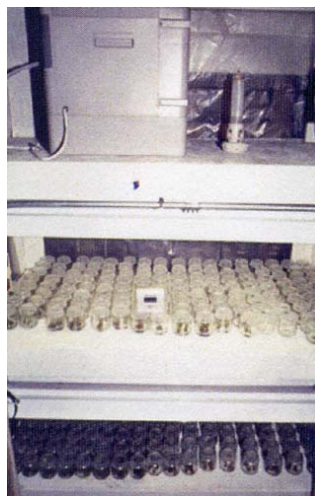
The culture chamber for microshoot production.

"They exceeded my expectations for development. The lingonberries have created a solid mat over the acreage where they were planted. I believe they can be a viable and sustainable field crop, but as with any new cultivated crop, it takes 20-30 years to fully develop their potential."