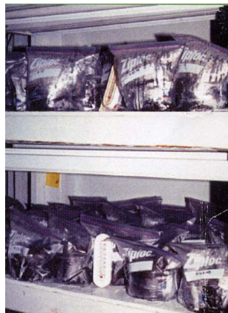
Propagation rolls enclosed in plastic bags at Talbot's on-farm laboratory.

The project made meaningful progress toward under-