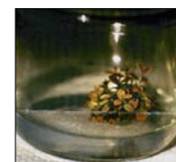
Young microshoots under high light intensity.

Although microshoot production was successful, rooting failures were unacceptably high. Additional research is suggested.