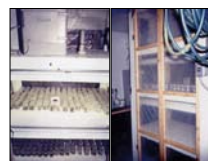
Culture chamber for microshoot production.