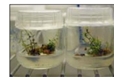
The lab supported 150 jars of developing cultures.

"They exceeded my expectations for development. The lingonberries have created a solid mat over the acreage where they were planted. I believe they can be a viable and sustainable field crop, but as with any new cultivated crop, it takes 20-30 years to fully develop their potential."