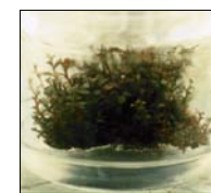
Young microshoots under low light.