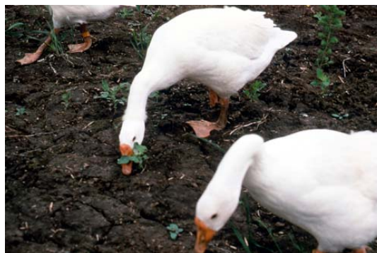
Geese feed at the University of Alaska Agriculture and Forestry Experiment Station Farm.

A potential alternative is geese, voracious herbivores that prefer many plant species that are also noxious weeds. Their use for weeding is not new: In the 1940s, before development of organic herbicides, 200,000 geese controlled weeds in cotton in the San Joaquin Valley of California. Geese have also been used for weeding in