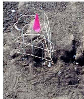
Wire tree protectors.

In the two-year study, weeds occurring in plots