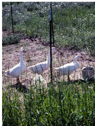
The geese found grassy weeds to be highly palatable.

Twelve white China goslings, fed poultry starter and flats of greenhouse-grown weeds (which they readily consumed), were separated at 5-6 weeks into four groups of three birds and released into field plots as weather permitted (June 12 in 1992 and May 26 in 1993).