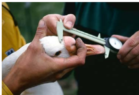
Geese stayed healthy during the study.

Trampling of the crop plants by geese was a significant cause of mortality during the first year of this study. The challenges inherent in using geese to control weeds are significant: time and expense to manage and protect the flock; protecting the crop from trampling; and the need for supplemental weed control. Whether the amount of herbicide displaced justifies those challenges will vary by crop, weeds and the amount of kind of herbicide needed.