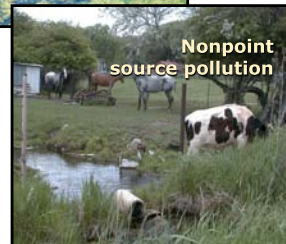
Nonpoint source pollution