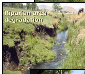
Riparian area degradation