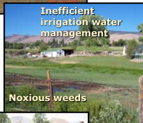
Inefficient irrigation water management