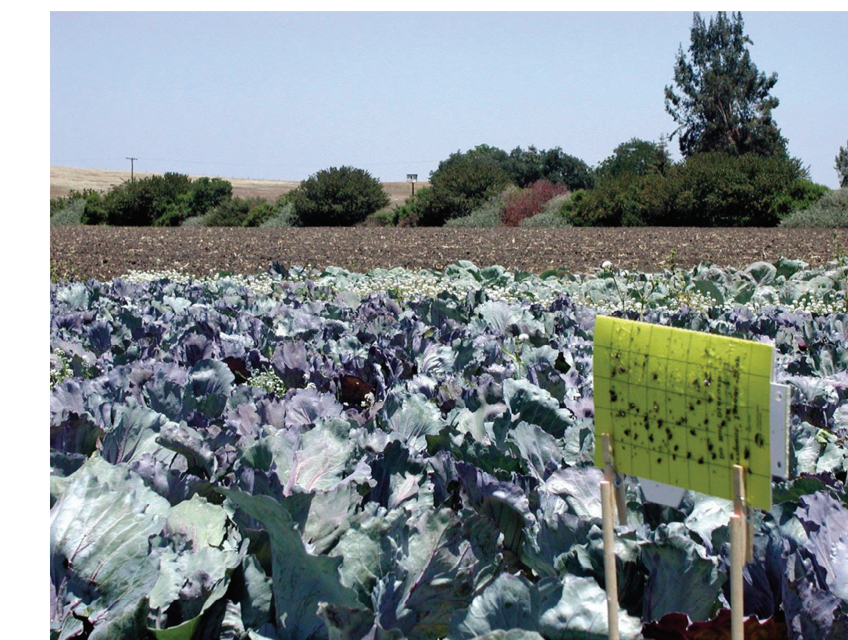
Sticky traps were placed in fields adjacent to hedgerows.

The crop matrix was found to influence parasitism rates. In 2006 at a hedgerow field, parasitism rates ranged from 70% in the brassica stand (50m from the hedgerow) to 0% on bare ground. In a control field planted entirely in brassica, parasitism rates declined from 80% at 10 meters to 20% at 100 meters, indicating that parasitoids may have been more abundant or active at the edges. In 2007, parasitism rates were higher amongst control fields than fields with hedgerows. However, the variability in crop matrix among fields makes these results inconclusive