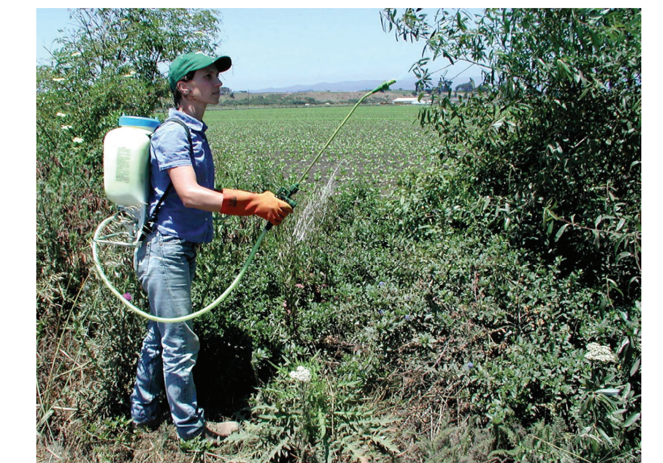
Hedgerows were sprayed with a fluorescent pigment to mark insects.