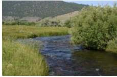
Grazed – Healthy Meadow Stream

Livestock grazing on streams associated with mountain meadows in California can negatively impact riparian vegetation, stream stability, water quality, and wildlife habitat. However, we have observed degradation at some grazed meadows but not others. This reflects differences in grazing management and meadow/stream resiliency to grazing. It is our opinion that identifying and promoting sustainable riparian grazing management is dependent upon: 1) working directly with grazing managers to identify grazing practices which maintain riparian health yet are logistically and economically feasible; and 2) conducting research at the management scale to insure the results are relevant at the management scale.