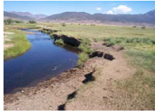
Grazed – Unhealthy Meadow Stream