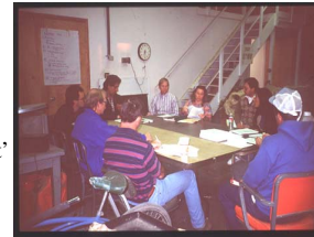
SAFS stakeholders during a planning session.