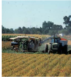
Tomato was the rotations' most valuable crop.