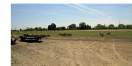
The sheep were not interested in the molasses-sprayed medusahead, instead moving to more desirable forages.