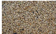
Grain with molasses in the feed bunk

Plots were sampled for botanical composition and forage biomass before and after application to see if higher concentrations enticed a greater impact on the medusahead and other plant species.