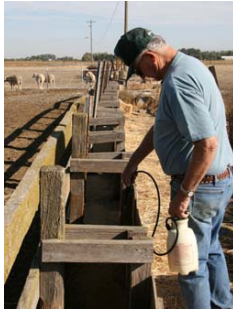
Molasses was sprayed on with a simple hand sprayer