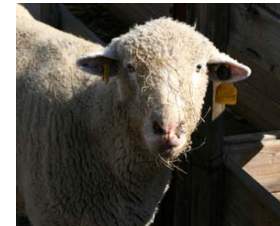
Medusahead never tasted so good.

Rangelands can be restored to systems with higher plant species diversity and higher forage value, thus increasing the overall value for livestock, wildlife, ranchers, and recreationists.