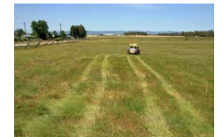
This patch of medusahead, sprayed April 30, 2008, with a solution of 50% molasses and 50% water, is mostly in the boot stage with a few plants already producing seed.