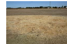
Several sheep readily consumed a patch of medusahead thatch sprayed with molasses after the training process in August 2007.