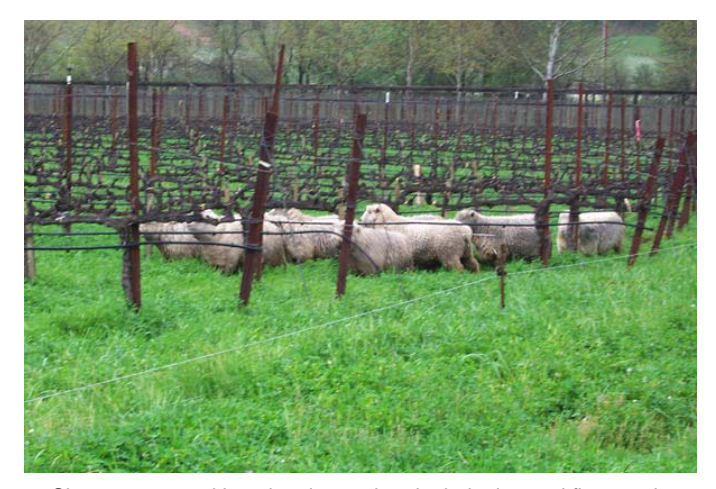
Sheep are turned into the vineyard to do their vineyard floor work.