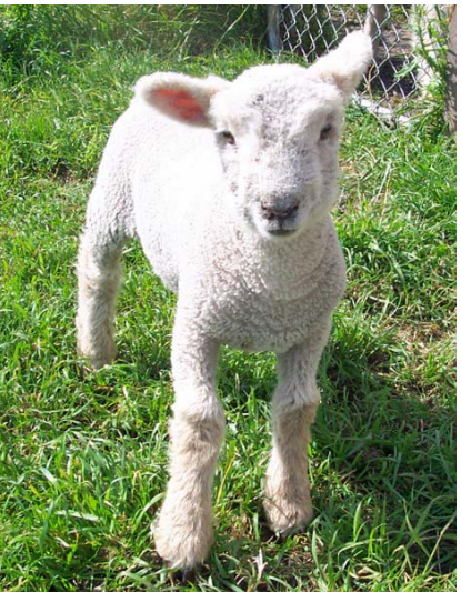
A month-old Babydoll lamb.