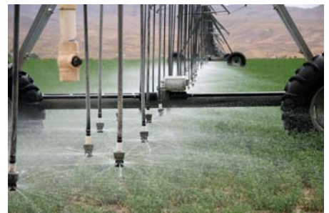
Grant Poole monitors soil moisture from irrigation in a nearby alfalfa field.

water, and increased pumping expenses behoove Mojave High Desert alfalfa growers to apply water with even greater care with the aid of soil sensors to monitor soil moisture.