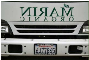
Marin Organic's delivery truck.

Marin Organic is an association of most of the organic producers and processors in Marin County. Over the last six years, we have worked together to plant and implement strategies to address issues that are important to small agricultural producers such as a regional marketing strategy that promotes Marin County farms and products with sustainable and environmentally sound farming practices.