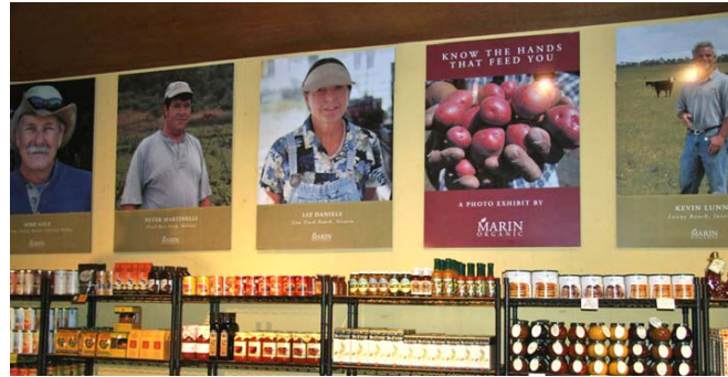
Customers at Toby's in Pt. Reyes Station got to "know the hands that feeds you" through large photos in the store.

We also wish to promote organics in Marin County including increasing the number of organic farms and expanding outreach to farmers and ranchers who are interested in switching to organic produce.