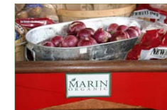
Identification signs were provided to farmers and retailers.