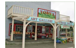
Marin Organic products were sold at Toby's in Pt. Reyes Station.