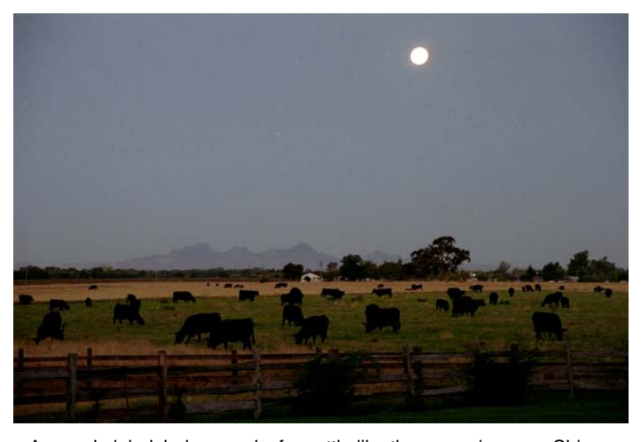
A sample label, below, works for cattle like these grazing near Chico.

specific information that verifies the healthful aspects of the products and to employ a marketing plan to promote the product and these beneficial attributes.