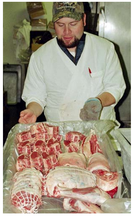
Participants learned about cuts of meat.