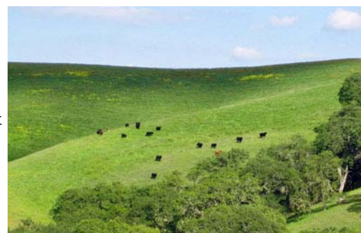
Cattle graze at Work Ranch.