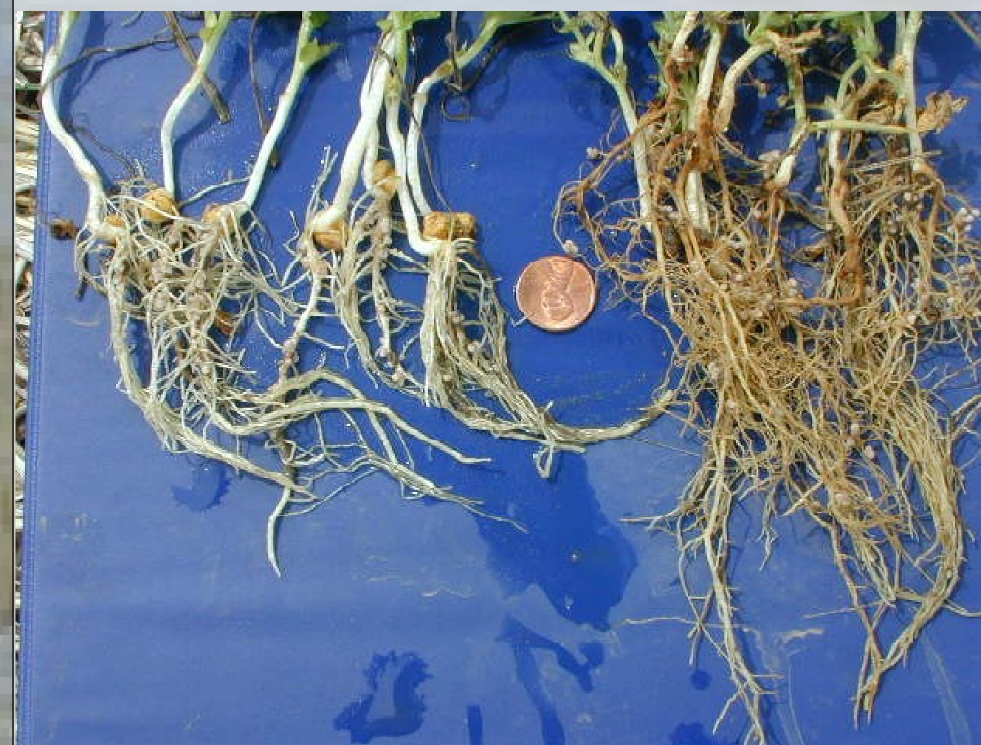
Spring pea roots on left, winter pea roots on the right, May 31, 2002. Note superior root formation and nodulation on the winter lentil.

➤Winter pea has consistently shown faster biomass accumulation within the growing season highlighting potential for high quality forage production, or as a green manure (Miller et al., 2008). Biological N fixation has begun sooner in the season, resulting in greater N fixation by a given calendar date or when the season is terminated by early summer drought. However, the depth of soil water extraction did not differ between winter and spring types of pea or lentil, with no water use observed below 3 ft.