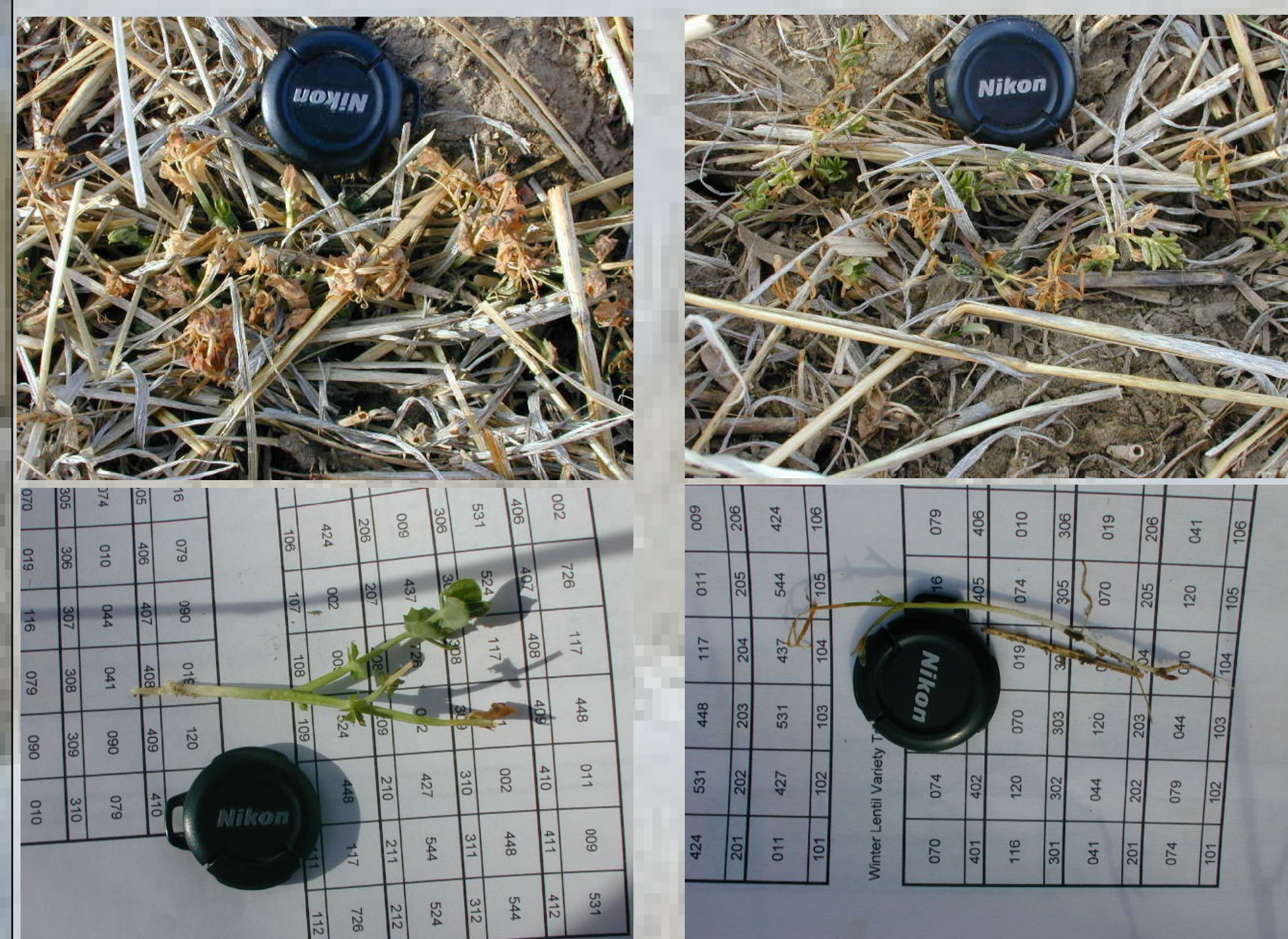
Pea on left, lentil on right. Note tissue damage (upper photos) from 5°F on April 1, 2002, and greater ability of pea seedling to regenerate shoots from below-ground nodes.

➤Pea has consistently shown greater winter survival in this and other studies at this location, possibly due to larger seed size tolerant of deeper seeding. In Rocky Mountain foothill environments it is very likely that the top growth of fall-emerged winter lentil and pea will be frozen off during snow-free periods in the winter, or during cold periods following spring snow melt. Pea and lentil must then re-emerge from below ground nodes. Frozen tissue damage may extend below the soil surface depending on the intensity and duration of the cold period, and shallower seeded lentils will suffer proportionally greater tissue damage.