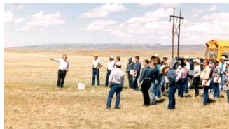
A WIRE class near Laramie.