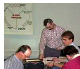
Participants work through goal setting and resource evaluation in the classroom.

Finding ways to more effectively analyze ranch or farm operations, set goals and formulate strategic pathways to achieve those goals could improve both profitability and quality of life for ranch and farm families.