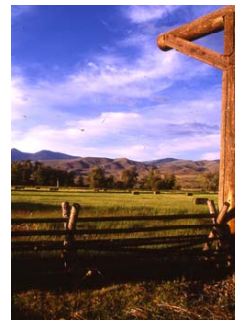
Taking inventory of operation resources is a key element in the planning process.

Western Integrated Ranch/Farm Education (WIRE) derives from a similar systems approach to managing agricultural operations, developed by the Texas Cooperative Extension Service, called Total Ranch Management, or TRM.