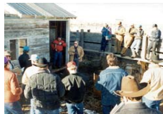
Instruction for WIRE conducted in Evanston, Wyoming.