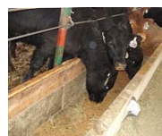
Heifers eating camelina meal.

The ecological sustainability of cropping systems will be compared by calculating an annual Soil Conditioning Index, a tool for measuring soil organic matter trends.