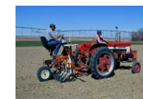
Sowing camelina seed.

If camelina can be economically produced and processed in the High Plains region: