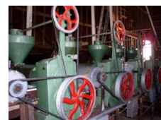
Camelina oil press.

To evaluate the production potential of camelina, the research team set up trials to assess yield, quality, growth patterns, climate and soil properties: