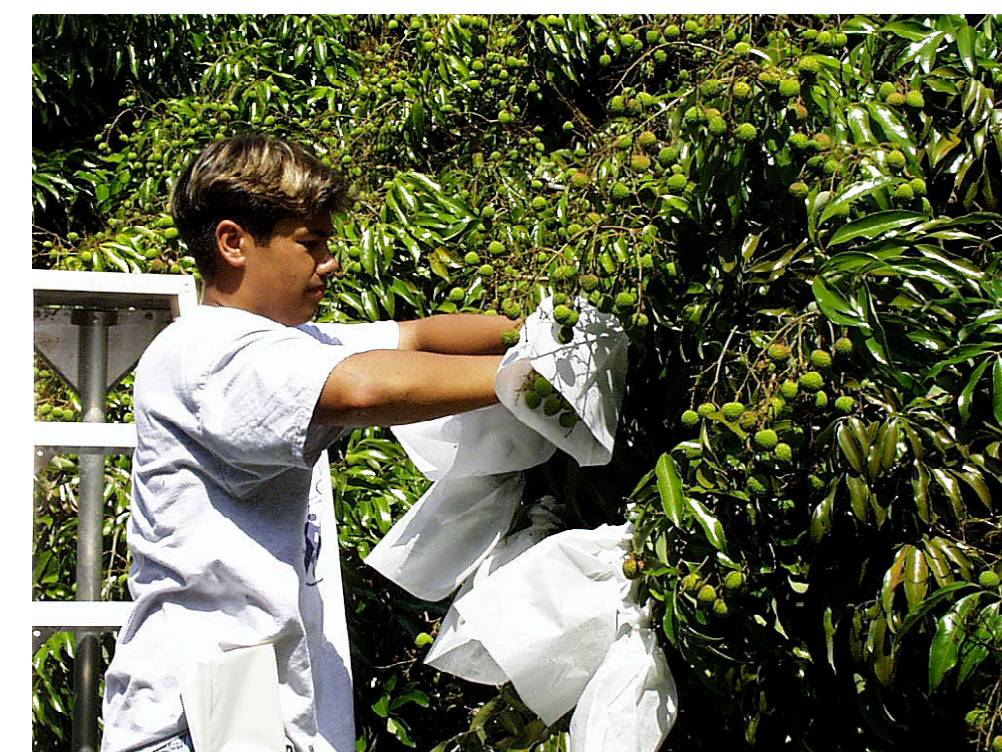
Bagging a lychee tree.

The bags used in the project, made in Nigata, Japan, are typically used to cover apples, Asian pear, loquat, peaches, grapes and mango to control ripening time, achieve the desired color and prevent pests.