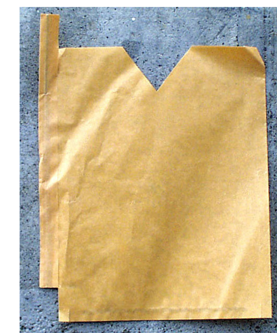
This wax-coated bag allows 46% light transmission.