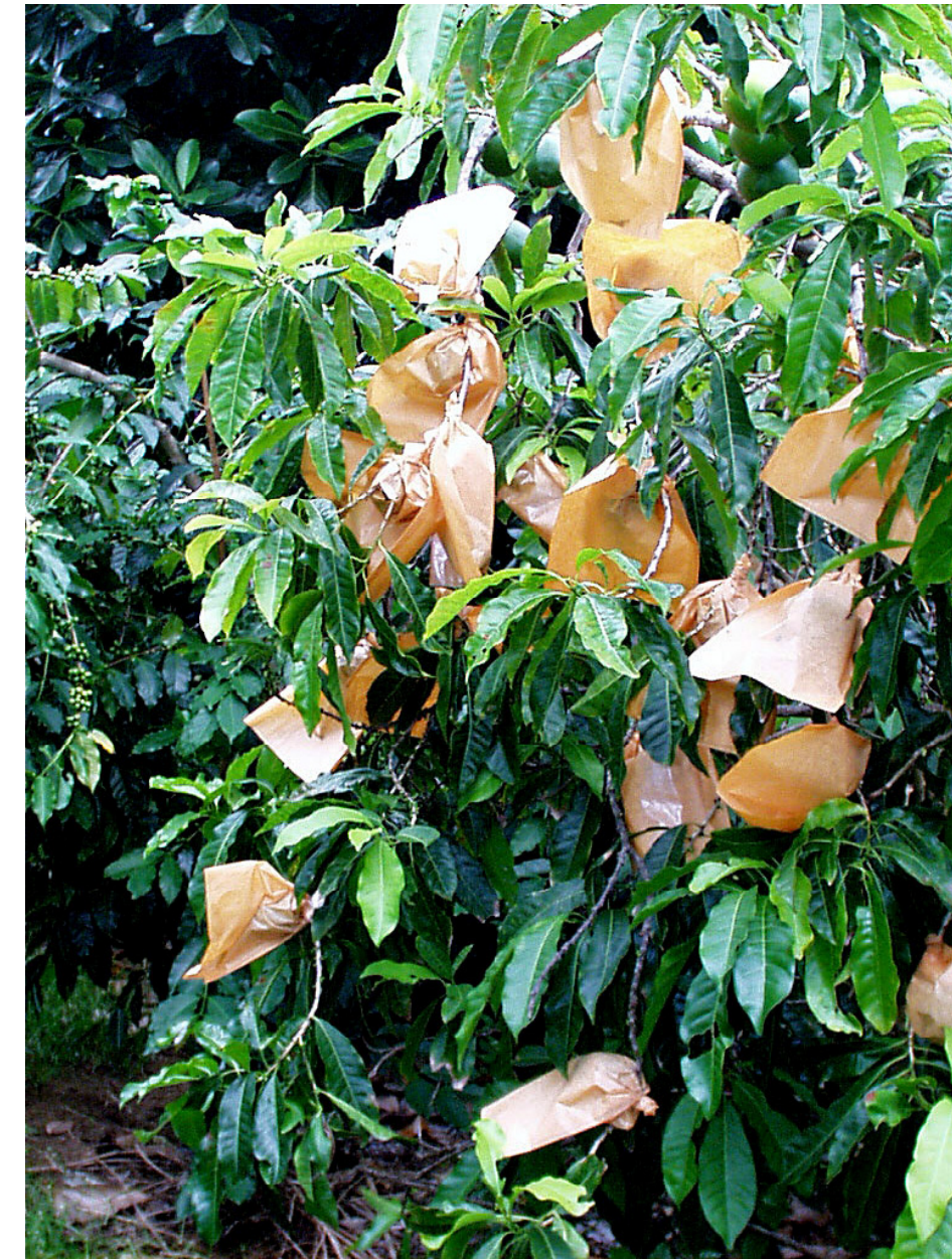
A bagged abiu tree.