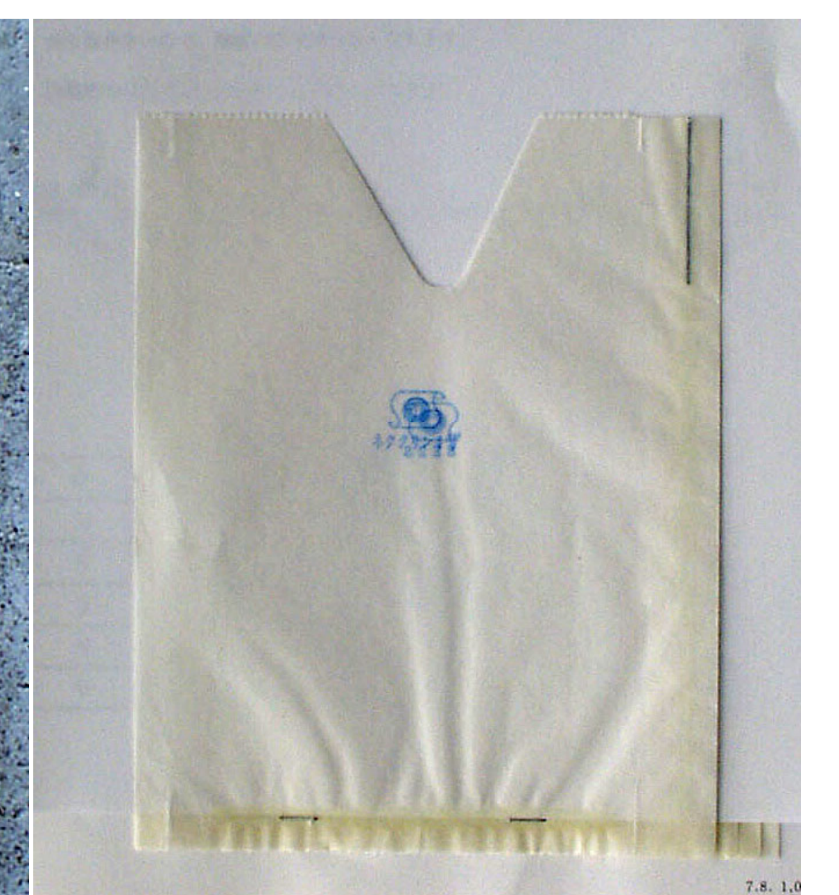
The light wax coating allows 50% light transmission.