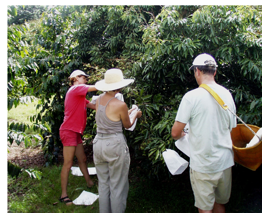
West Hawai'i Chapter members of Hawai'i Tropical Fruit Growers participate in bagging time trials.

Bagging mango, figs and guava also proved beneficial, but more testing is needed to determine the best bags. Tests on tomato, pineapple and cucumber are encouraging, but more testing is clearly needed before recommendations can be made.