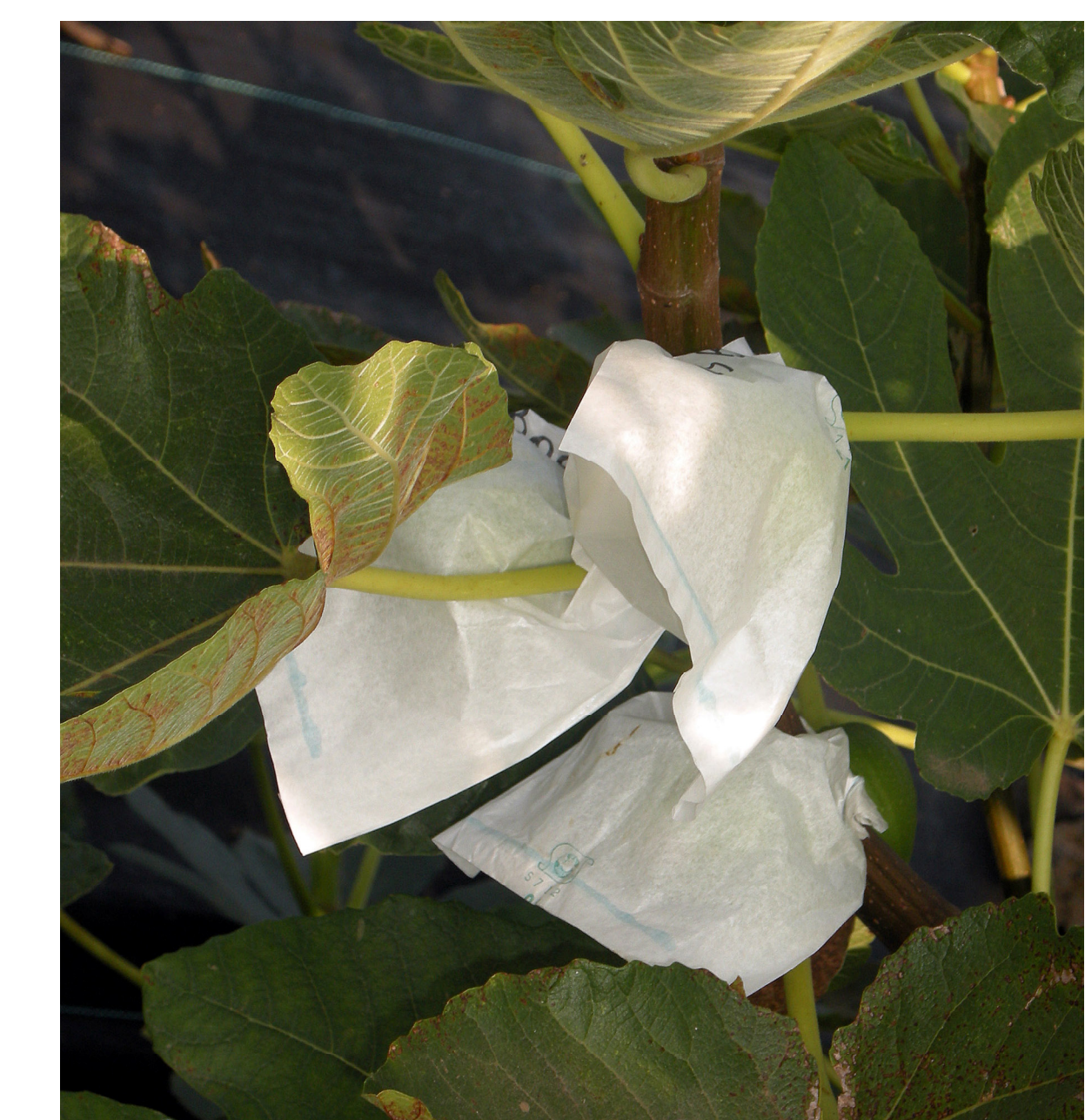
Bagged fruit on the tree helps regulate ripening.