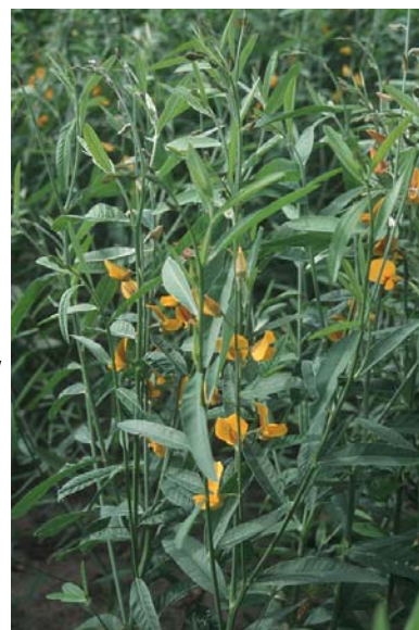
Sunn hemp in flower.

We anticipate that this project will increase the confidence that growers need to transition into a sustainable and economically viable production system.