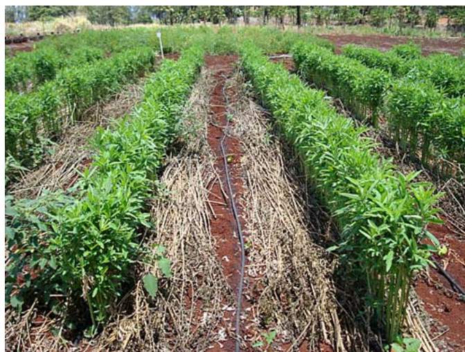
Alternate rows of sunn hemp are strip-tilled and planted with cucumber seedlings. Sunn hemp biomass is clipped and laid down as sunn hemp mulch.

Sunn hemp ( Crotalaria juncea ) is known for its ability to improve soil nutrient status. However, when incorporated into the soil, it releases allelopathic compounds that are toxic to nematode pests. Further, when used in a strip-till cropping system, sunn hemp (SH) residues that remain on the soil as surface mulch can create a habitat favorable for natural enemies of insect