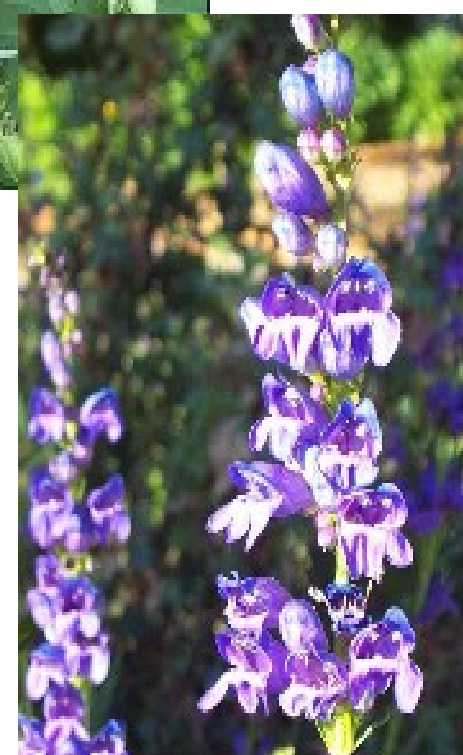
From left, these drought-tolerant plants are penstemon palmeri, Rocky Mountain columbine and Rocky Mountain penstemon