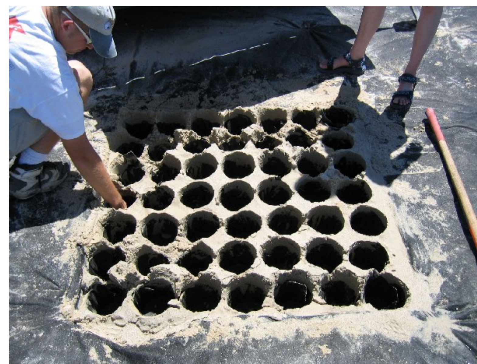
Pots are being installed at the Utah State University Greenville Farm.