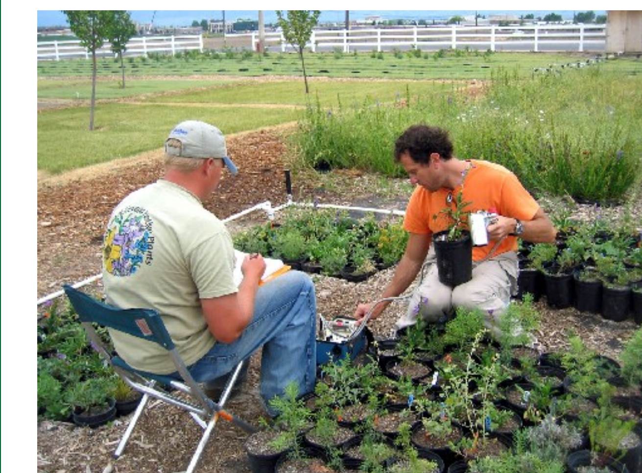
Pot plant status is being assessed.

Both growth and stomatal conductance measures showed that trees in copper-painted pots performed significantly better than those in fabric-lined containers, as the latter tended to impede drainage and limit growth.