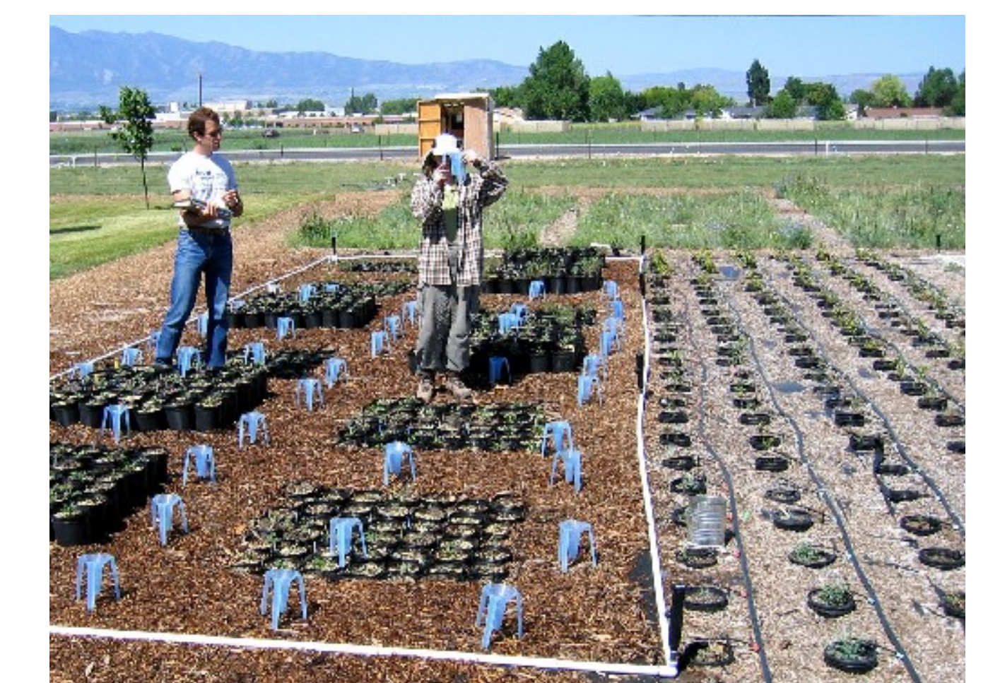
Data are collected at the pot plot.