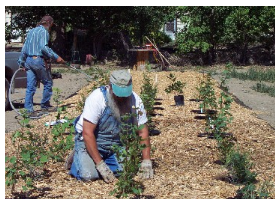
Trees planted in pots are installed at Chelsea Nursery in Colorado.

Such plants are difficult and expensive to grow under conventional nursery production systems, either in fields or in above-ground containers. However, a hybrid between those two systems, called pot-in-pot production, may be well suited to effectively producing native plants in the Intermountain region.